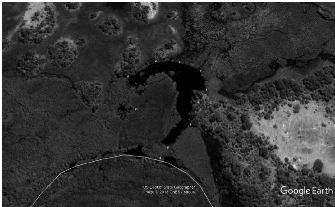
Figure 1: The boundary of the Qhuqhumupa Fisheries Reserve in the Balyerwa Conservancy, Kwando River. (Perimeter 0.6km).