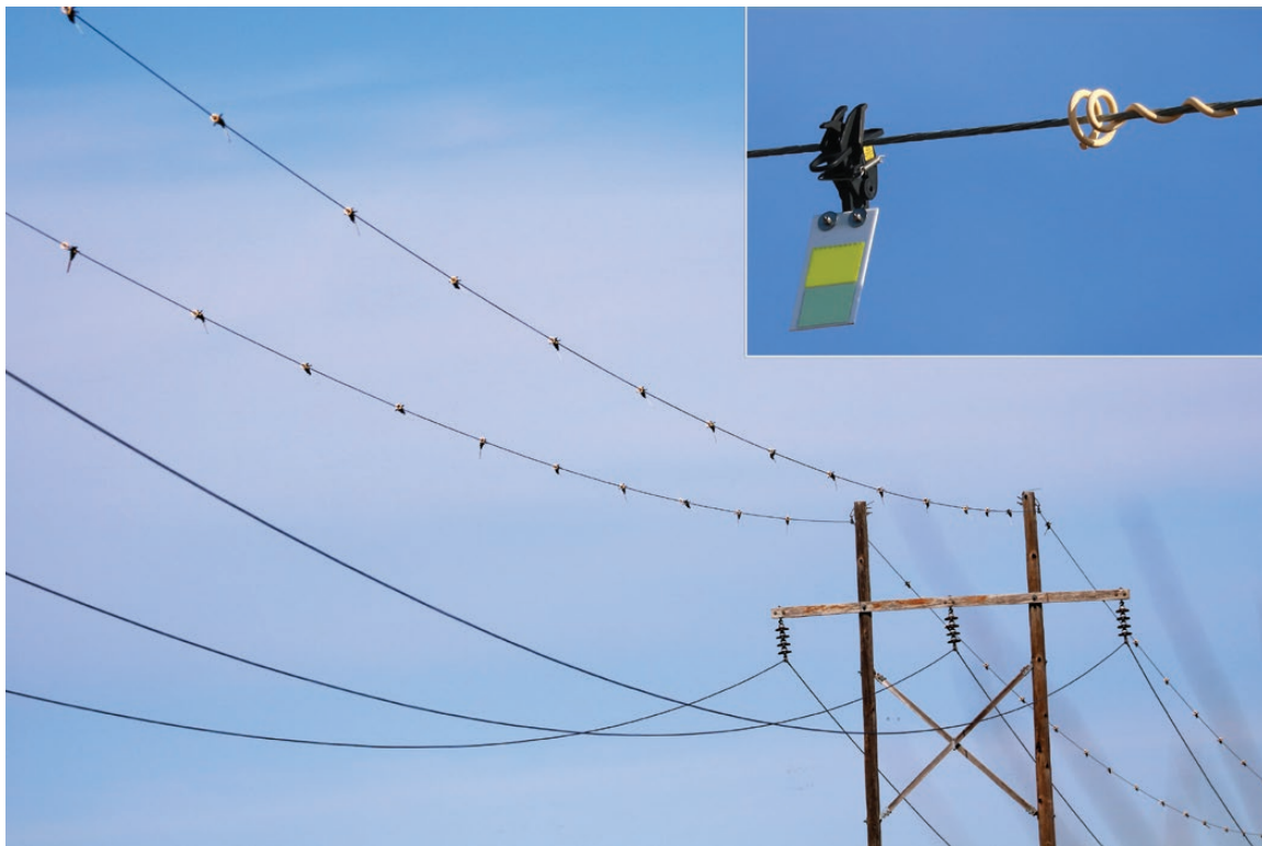
FIGURE 1. Two types of line markers were present on the power line we studied at the Iain Nicolson Audubon Center at Rowe Sanctuary in central Nebraska, but were not effective in preventing Sandhill Crane collisions. (Overview) The span we studied crossing the Central Platte River. (Inset) Close view of a FireFly (left) and a Bird Flight Diverter (right) installed on the power line prior to our study.

been tested to date have been found to be sensitive to ultraviolet (UV) light (Harness et al. 2016), including bird species in the orders Anseriformes (waterfowl), Galliformes (grouse), Gaviiformes (loons), Procellariiformes (some seabirds), Ciconiiformes (storks), Pelecaniformes (pelicans), Strigiformes (owls), and Passeriformes (songbirds), all of which include species that are susceptible to collisions with power lines (APLIC 2012, Sporer et al. 2013, Bernardino et al. 2018). Many avian species not sensitive to UV light are sensitive to a broader violet spectrum than humans see (Harness et al. 2016). Human eyes are sensitive to light with a minimum wavelength of ~400 nm. Although human eyes contain cones capable of sensing shorter wavelengths, the UV-absorbing lens of the human eye prevents entry by those wavelengths (Jacobs 1992). In contrast, avian vision is sensitive to wavelengths as short as 320 nm, depending on the species, due to differences from humans in lens physiology and photoreceptors (Parrish et al. 1984, Aidala et al. 2012, Ödeen and Håstad 2013). Avian sensitivity to light has previously been explored as a potential mechanism of modifying bird behavior. For example, Blackwell et al. (2012) and Doppler et al. (2015) evaluated Canada Goose ( Branta canadensis ) and Brown-headed Cowbird ( Molothrus ater ) responses to “white” and 470 nm lights, respectively, mounted on model aircraft, and Foss et al.