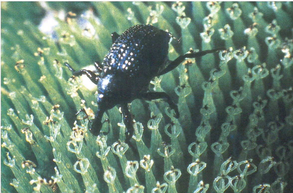
Cyrtobagous salviniae , the biological control agent, which is successfully controlling the invasive aquatic weed Salvinia molesta , Kariba weed, in the Eastern Caprivi.

Future threats include new introductions via the nursery and pet trades, reforestation programmes, game farming and expanding aquaculture enterprises.