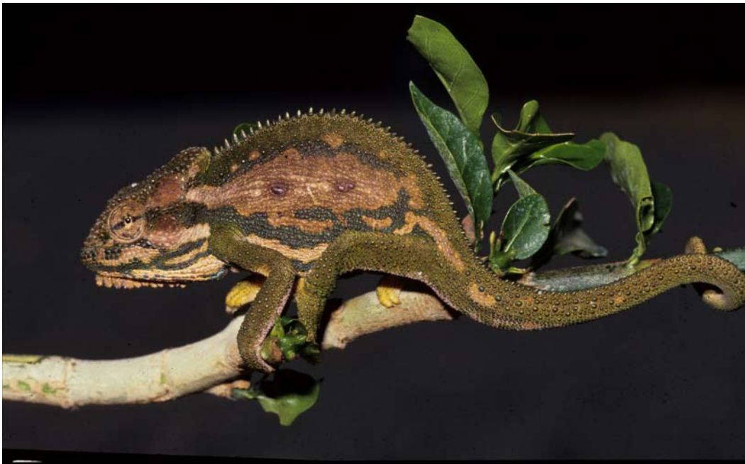
Bradypodion pumilum , the Cape Dwarf chameleon has been recorded from gardens at the coast. Little is known of its ecology.

Finally, the report includes a detailed bibliography that goes beyond the articles and documents referred to in the main report. Articles referred to in the text are marked with an asterisk within the wider bibliography of useful references pertinent to invasive alien species. This bibliography is intended for use by future researchers interested in invasive alien species in Namibia and for inclusion in the national database. The questions and responses of all interviews are included in full in Annexure 6 and Annexure 7. On a national level, this report is intended to provide a sound basis for future awareness-raising, research and management activities; at a regional level, it is intended to serve as Namibia's contribution to an SADC-wide study on invasive alien species, providing pertinent and factual information on the Namibian situation for the SABSP.