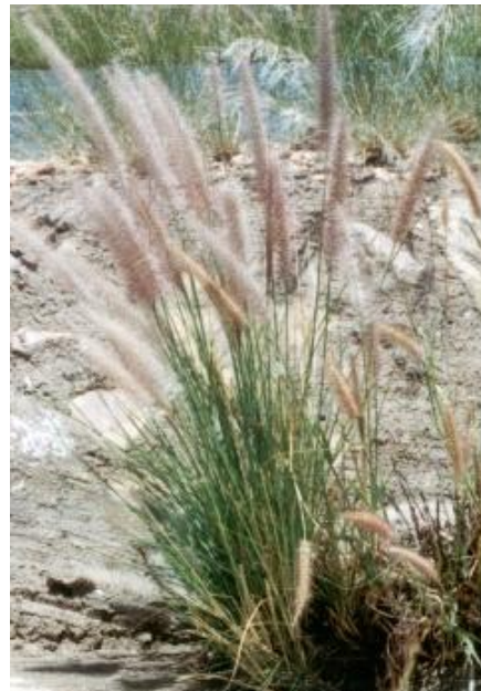
Pennisetum setaceum , Fountain grass, has shown a dramatic increase in central Namibia since the 1980's. Originally introduced as a garden ornamental, it is now commonly seen in Windhoek and elsewhere in Namibia.

In order effectively to deal with invasive alien species issues, it is important for Namibia to ratify both the International Plant Protection Convention and the African Convention on the Conservation of Nature and Natural Resources; to comply with obligations flowing from existing international and regional treaties; and to take steps to harmonise national policies and laws with principles agreed internationally and within the SADC. An excellent example of such an approach being taken is by the MFMR, in the course of the recent development of the Aquaculture Policy and the Aquaculture Act.