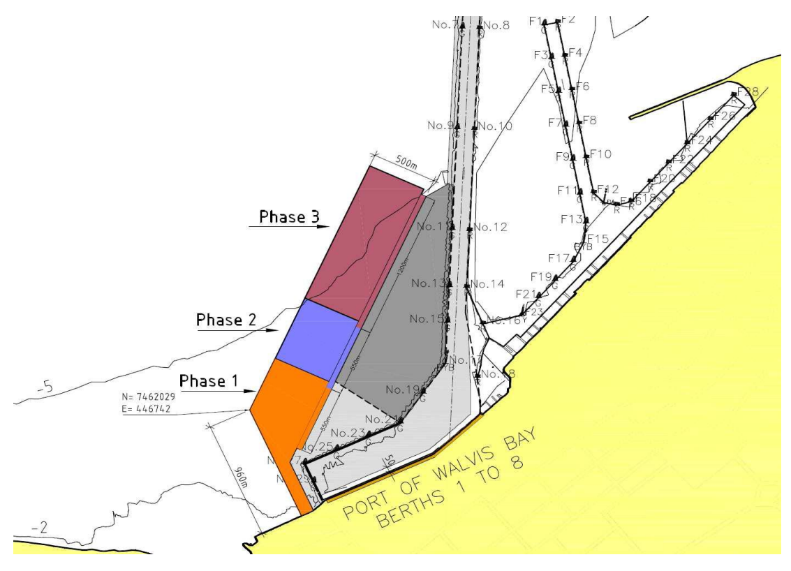
Figure 1: Three phases of proposed container terminal expansion