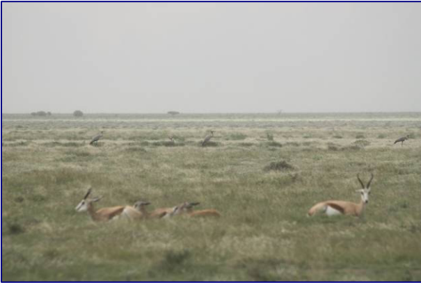
An unusual photograph of three (of a group of five) Blue Cranes in the rain (behind springbok) a few km east of Adamax on 10/2/07