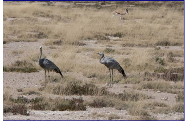
On 4/5/09 I came across these two Blue Cranes on the main road across Salvadora in Etosha - the right one had a green ring on the right leg (ringed bird is possibly NHD, ringed Apr 06 – W. Versfeld)