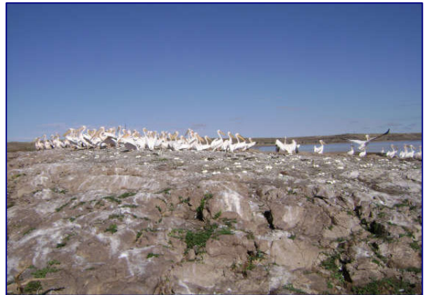
Pelican breeding at Hardap Dam, February 2009