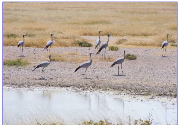
Group of 8 Blue Cranes at Salvadora on 16/4/09, including Marconi, the radio-tagged bird (see page 2; photo Wilferd Versfeld)