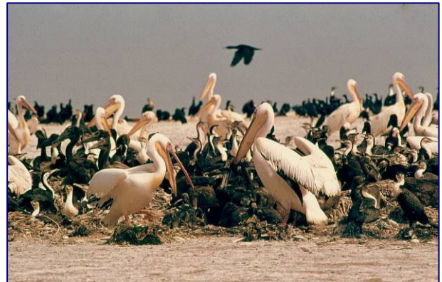
Top: Male (background) & female (foreground) White Pelicans in breeding plumage Below: White Pelicans at nests on Walvis Bay guano platform

ascending spiral. Approaching 10 000 feet the birds peeled off and set sail, as it were, in a north-westerly direction. We throttled back and followed the flocks, looping around them. Lake Oponono came into view, exactly to where the flight was heading. They settled on the water, joining hundreds of others, which were feeding on the abundance of fish trapped in the shallows. Back at base, we pored over a map. The minimum straight line distance from the breeding colony on the Pan to the lake was 100 kilometres. Consequently, the return trip made by the adults totaled 200 kilometres or more each time they wanted food, which was probably at least every second day. Apart from feeding themselves, the adults were also meeting the voracious appetites of rapidly-growing young.