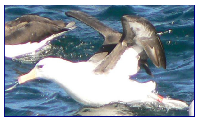
Black-browed Albatross – note red darvic ring on left leg

8/7/08: I recently managed to photograph a ringed Black-browed Albatross +- 140km SW of Walvis. Other interesting birds on the trip included 3 Spectacled Petrels, 2 Wandering Albatrosses and what was probably an Antarctic Prion. The following mail is the reply from Andy (British Antarctic Survey/BAS) who ringed the bird.