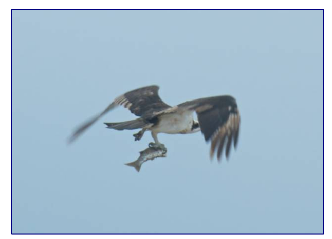
Walvis Bay's Osprey is still being seen regularly