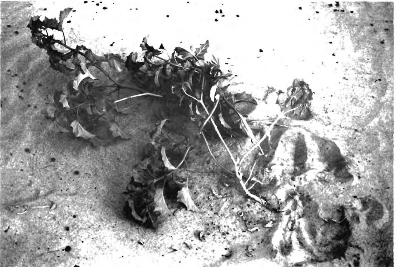
PLATE 2: Typical baboon damage to Datura plants. The plants are uprooted and the basal stems partially eaten. Foliage is ignored.