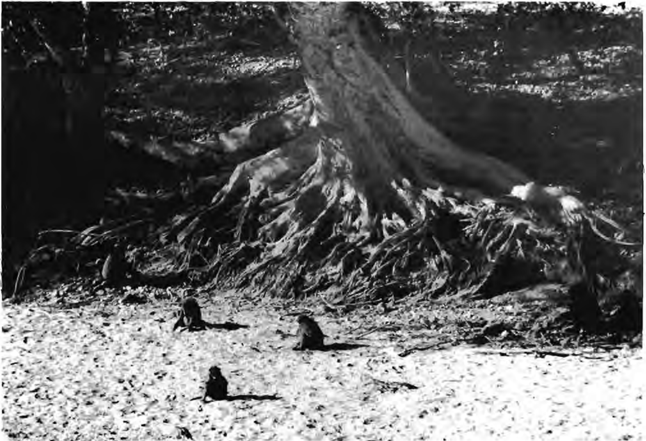
PLATE 3: Chacma baboons excavate sand for dehydrated fig fruit fragments left from previous fruiting episodes. Two females and a juvenile work in the sun. Two adult males excavate in cooler, filtered shade, preferred excavation sites.

seeds of the acacias and dried fragments of the figs were systematically excavated by members of all three troop in the dry riverbed sand beneath these trees (Plate 3). Fig fruits so obtained were fragments from earlier processing when more favourable conditions prevailed or were dessicated fruits which fell to the ground and had been covered by dry wind blown sand. As at Cyperus clumps, males were at an advantage and regularly supplanted females at excavations.