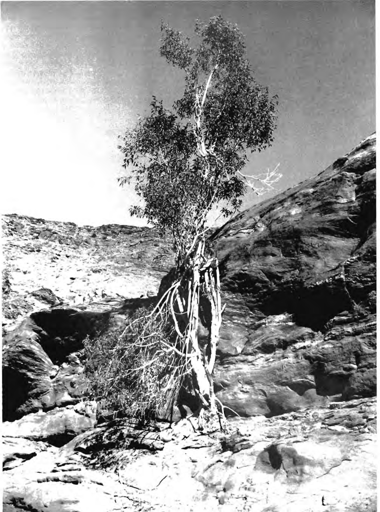
PLATE 5: A Ficus cordata tree heavily damaged by baboons in the course of fruit gathering. Over 60 per cent of the total trunk diameter was broken and killed by baboons. One fruit crop was removed by adult male baboons during part of one day.