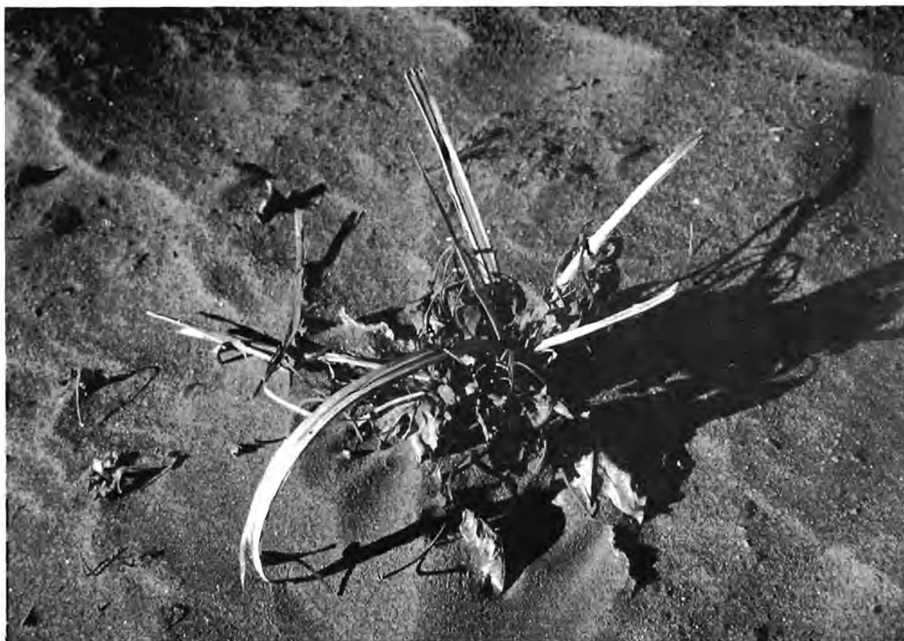
PLATE 4: Typical extreme damage to a Nicotiana glauca plant by baboons. Green leaves have sprouted, then the plant has died of drought.

branches until they broke so that higher fruits were brought within easy reach. Over half of the woody branches and trunks of this tree were destroyed in less than two hours (Plate 5). This tree did not recover vegetatively noticeably in the next six years, and probably did not fruit again during that interval. In October, 1985, it had barely regained the dimension of the tree damaged by male baboons during a single day 12 years earlier. It appears that within — group competition is, at least for conditions reported here, a more powerful determinant of foraging behaviour than any gain which might result from resource conservation.