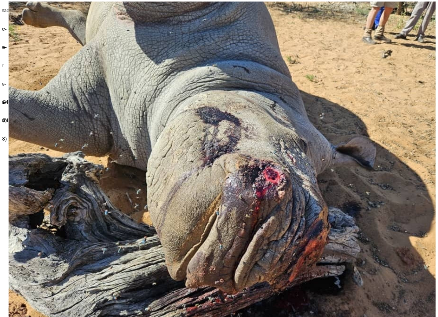
The carcass of a white rhinoceros bull was found on a farm in the Gobabis district on Sunday. Photos provided ( https://cdn.nmh.com.na:2083/S3Server/republikein/uploads/images/2024/05/07/305087.jpeg )