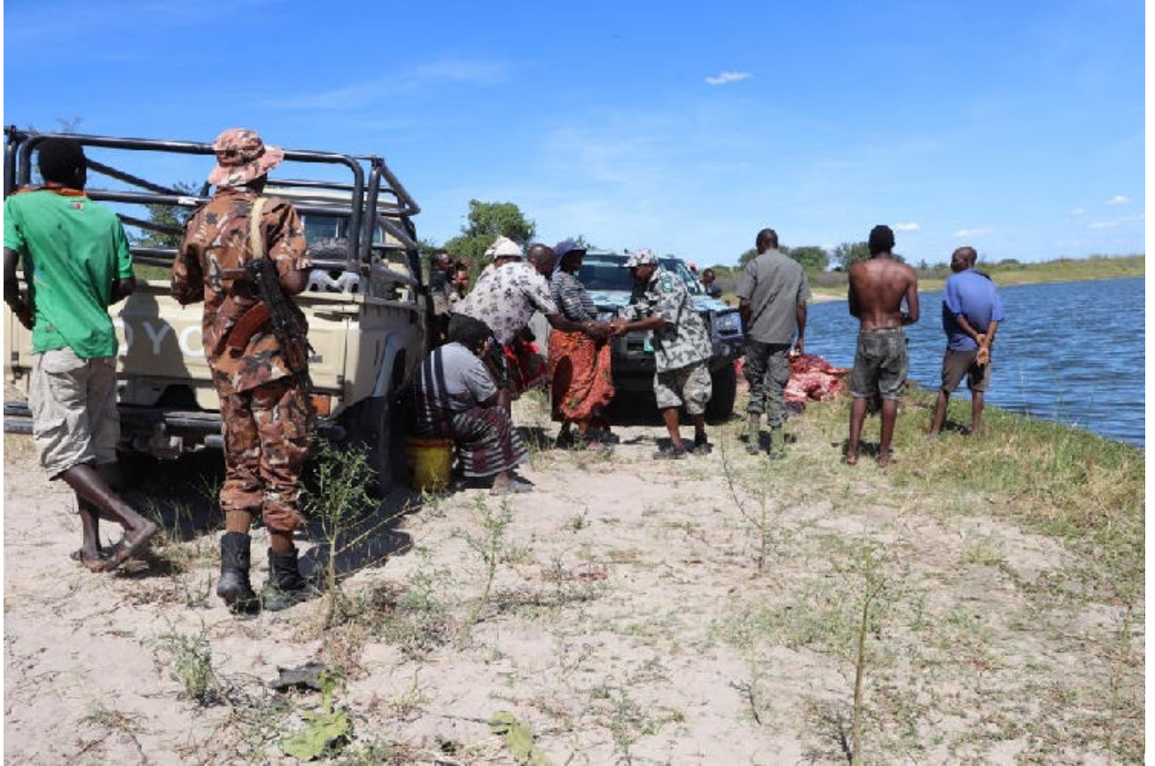
POACHED ... Muyako villagers on Sunday morning discovered the carcass of a poached hippo.

THE Ministry of Environment, Forestry, and Tourism has launched an investigation into the poaching of two hippos in the Muyako area of the Zambezi region.