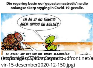
Cartoon for December 15 15th of December 2020

Rhino horn, ivory found on Swakop plot ( https://www.republikein.com.na/nuus/renost ) 1 day ago | Crime (https://www.republikein.com.na/kategorie/misdaad/) An elderly man was allegedly caught with an old rhino horn and five pieces of elephant tusks in his possession at the Swakopmund River pl