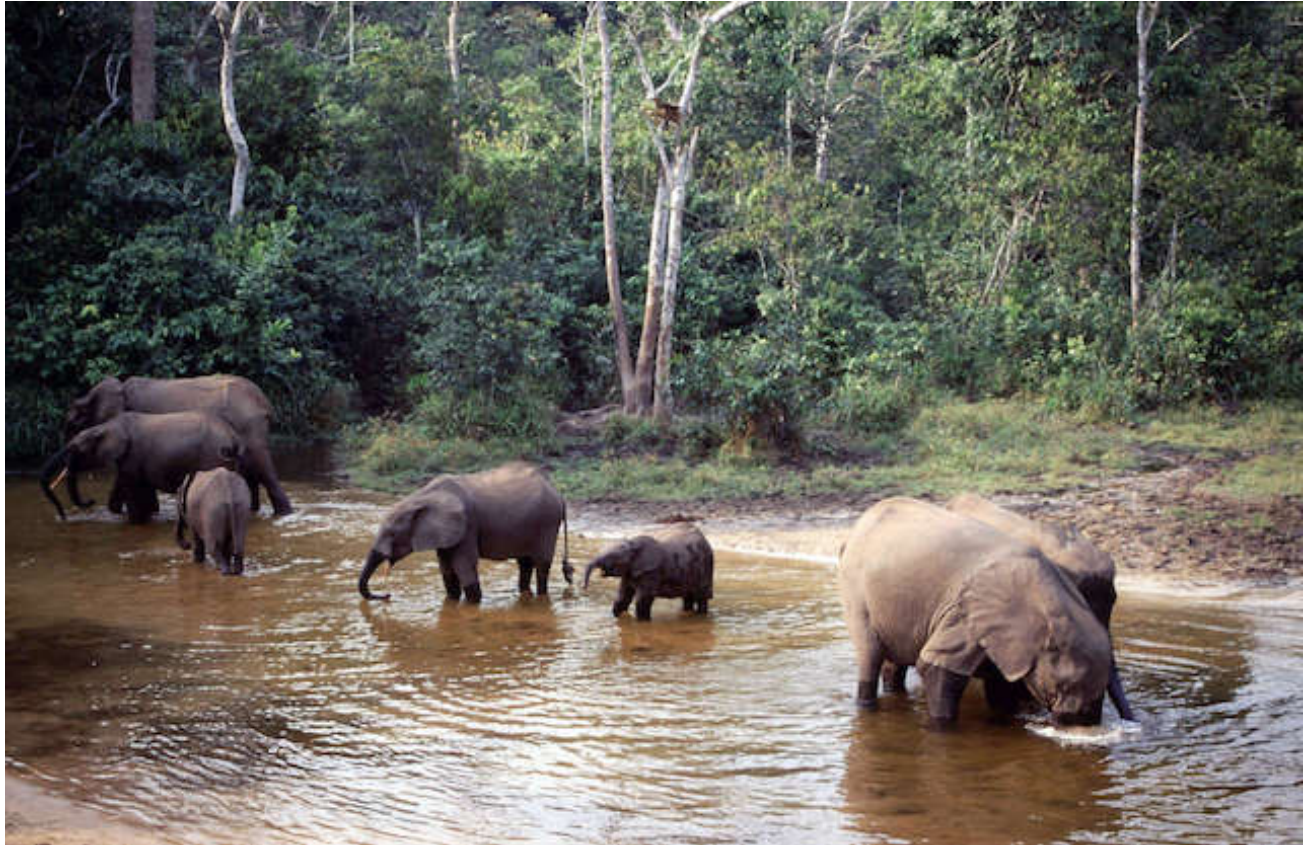
NATIONAL TREASURE... The Republic of Congo's rare forest elephants are a separate species from the larger African savanna elephant.