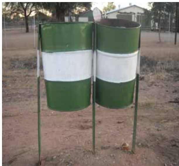
Figure 4: Waste storage drums that could be used in the landscape.