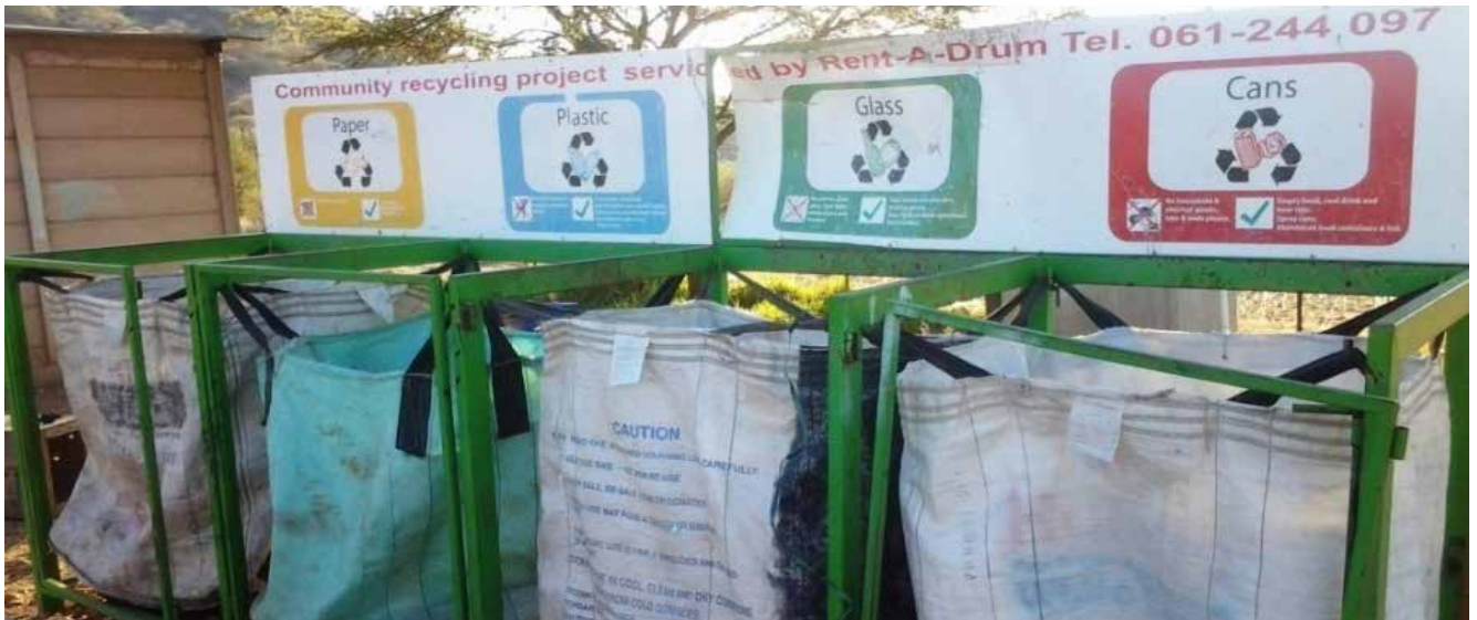
Figure 5: Example of a Recycling Station.

Residents who produce bulky waste and have their own transportation such as local businesses are encouraged to transport the waste to the waste disposal site themselves. This will reduce the pressure on the two options discussed above.