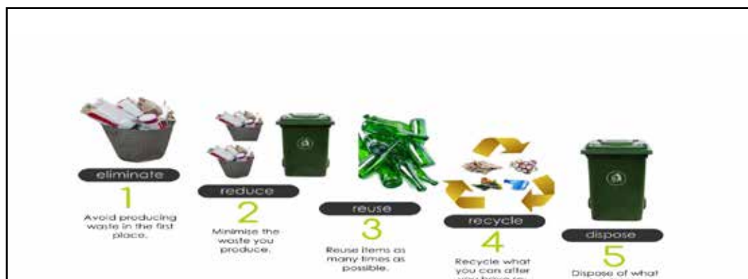
Figure 3: Integrated Waste Management Hierarchy

The storage, transportation, treatment and disposal of waste can be a very expensive exercise that requires a lot of input from all stakeholders. However, there is a call to reduce the costs associated with the management of waste. This can be done by implementing the Integrated Waste Management Hierarchy as shown on Figure 3 below, which encourages members of the landscape to first avoid the production of waste; were the avoidance of waste is not possible the amount of waste produced be minimized, and to reuse and recycle waste before disposal is contemplated.