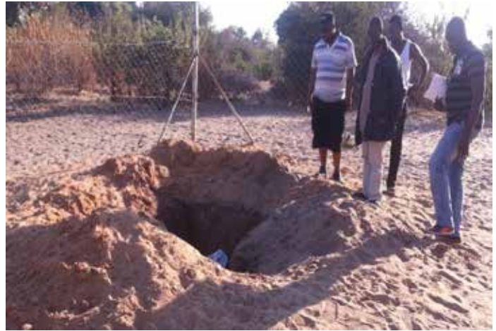
Pictures: Littering, dumping and disposal of waste in the Mudumu Landscape