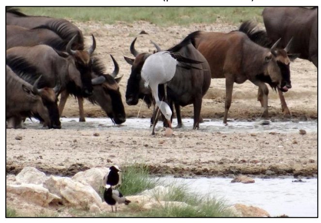
First breeding attempt recorded at Andoni waterhole in the north of Etosha