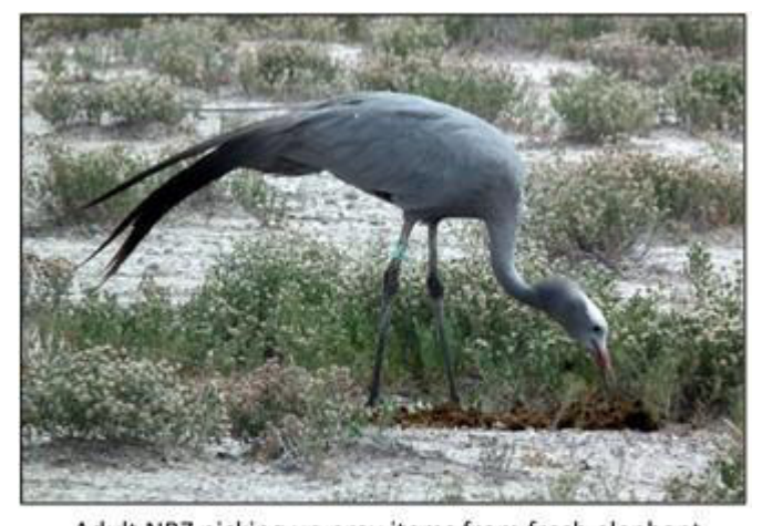
Adult NBZ picking up prey items from fresh elephant dung in the Chudop area on 8 April 2016: is this an adaptation for successful feeding during dry times? (see newsletter No. 55)

This is in a wet meadow system, so I imagine in an arid system like Etosha, it might be even more attractive for some invertebrates. Indeed, under some conditions these "hotspots" (if such they be) might be critically important in