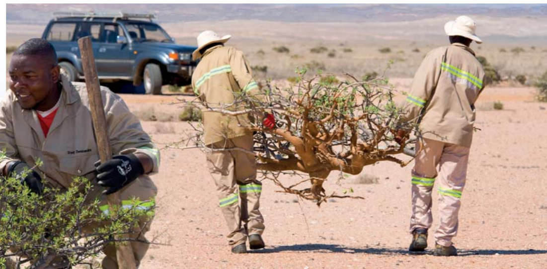
Two helpers carry a large specimen to the vehicle. The thick stems in which the plant food reserves are stored, can be seen easily.

Why did it grow here, and not in the sandy, more hospitable soil overlay?