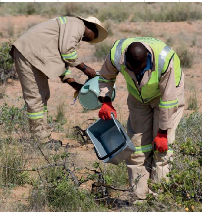
Plants are watered to soften the soil and loosen their roots before removal.

Why did it grow here, and not in the sandy, more hospitable soil overlay?