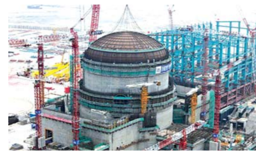
The Taishan nuclear power station is one of 27 reactors currently under construction in China. The dome on the reactor building, which is constructed by Areva of France, was successfully installed in October 2011.

Among the first contracts that will be placed, are those for the temporary and permanent access roads, the temporary pipeline from the Rössing Reservoir, the bulk earthworks, the construction camp, the acid plant, the main intake substation, the 90MVA transformers, the mobile pit substation, the fuel depot, the Engineering, Procurement and Construction Management (EPCM) service provider and