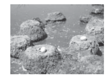
Figure 3. Two of the nests contained eggs, presumed to belong to Lesser Flamingos.

It is not clear why Lesser and Greater Flamingos do not complete their breeding attempts at Kamfers Dam. Disturbance by dogs and humans, as well as an often rapidly receding water level, may be responsible (Anderson 2000a). In order to solve these two problems and perhaps promote breeding of flamingos, Anderson (1996) proposed that