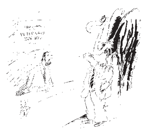
"Can you do anything to stop him chasing ambulances?"