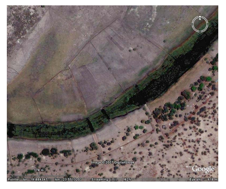
Figure 1: Molapo fields partly flooded.

A land use assessment on the basis of satellite images carried out by the University of Botswana found that of 48,900 hectares cleared for cultivation in Ngamiland, 75% consist of dryland fields and 25% of fields in temporarily inundated floodplains (Figure 1). they grow. Despite recent rapid population increase,