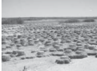
Figure 2. Large numbers of nests were present at Kamfers Dam during the water-bird survey conducted on 24 January 2004.