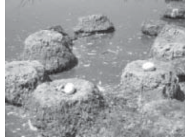
Figure 3. Two of the nests contained eggs, presumed to belong to Lesser Flamingos.

eggs (Fig. 3). The eggs were collected, measured ( 50.6 \times 81.8 mm; 54.1 \times 88.6 mm) and deposited in the egg collection of the McGregor Museum, Kimberley. Their dimensions suggest that they belong to Lesser Flamingos.