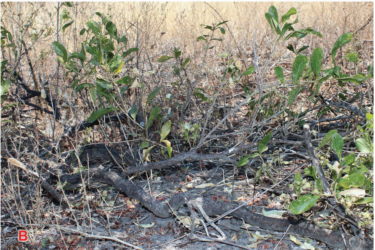
FIGURE 1. M. sebrabergensis in its natural habitat. A, clonal growth with several ramets in foreground, showing ascending shoots, \pm 0.7 m tall; trees in background are Acacia kirkii Oliver (1871: 350). B, suffrutex showing flood-exposed runner.