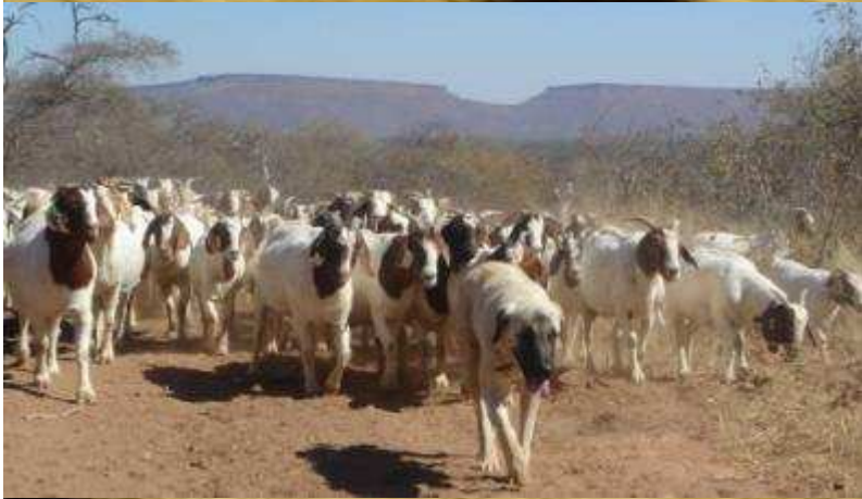
Livestock Guarding Dogs