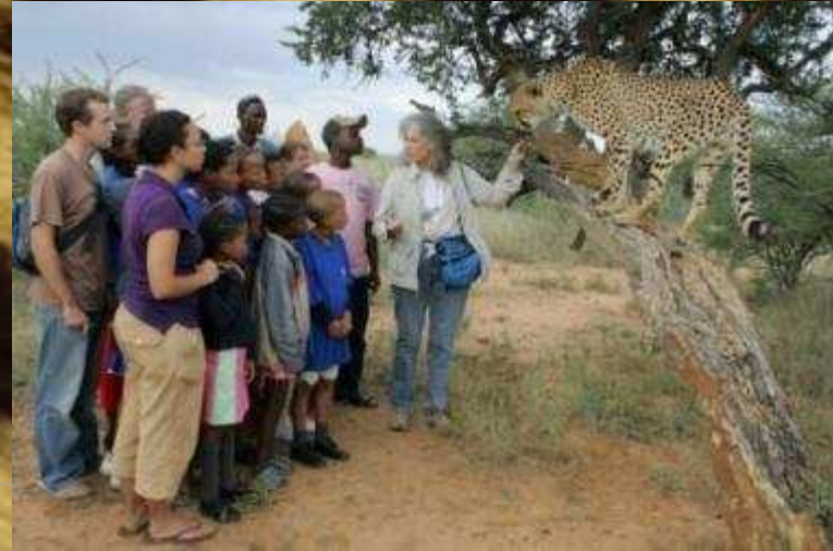
Education of students