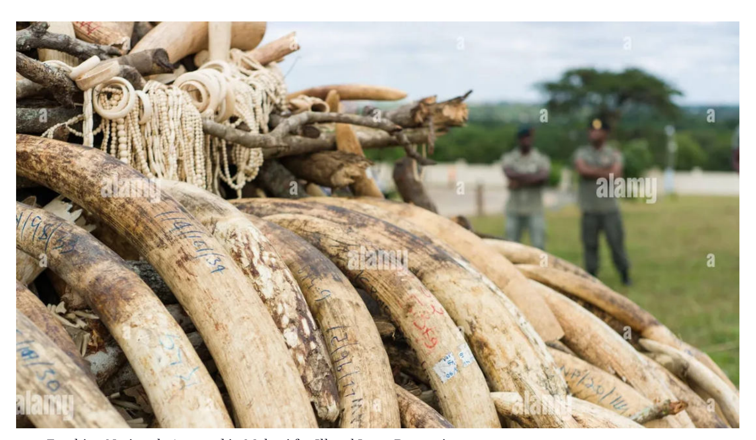
Zambian Nationals Arrested in Malawi for Illegal Ivory Possession