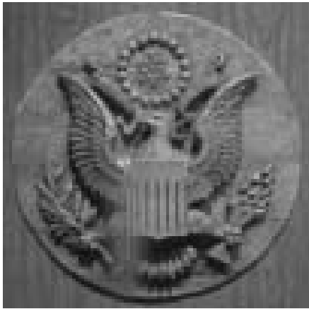
Fig. 2. A replica of the passive bugging device superimposed on the Great Seal of the U.S.A.

so, electronic packages, for all their micro-miniaturization, still required some form of battery to power them and it was this power source that usually provided most of their bulk. A device that could be powered remotely was clearly the long sought-after ideal. It came, at least as an idea, as a result of a long-running episode of espionage and counter-espionage carried on as a matter of routine between the embassies of the East and West.