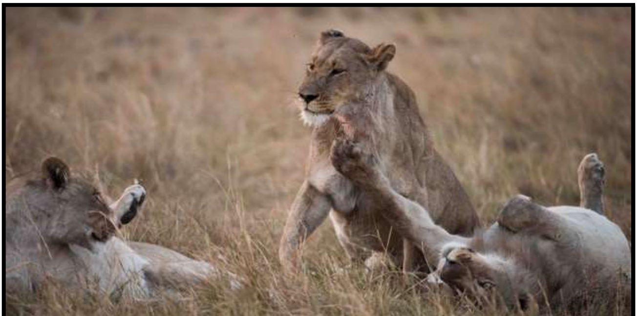
The third lioness from the Horseshoe pride is about seven years of age, and currently has three large cubs of about 18- months old that are regularly seen at Serengeti in the Kwando Core Area.