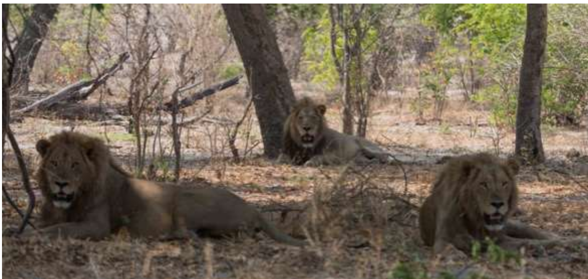
The 'Angola males' were born in the Horseshoe pride in 2012 (above), dispersed in 2015 at three years of age (centre), and are now about five years of age (below).