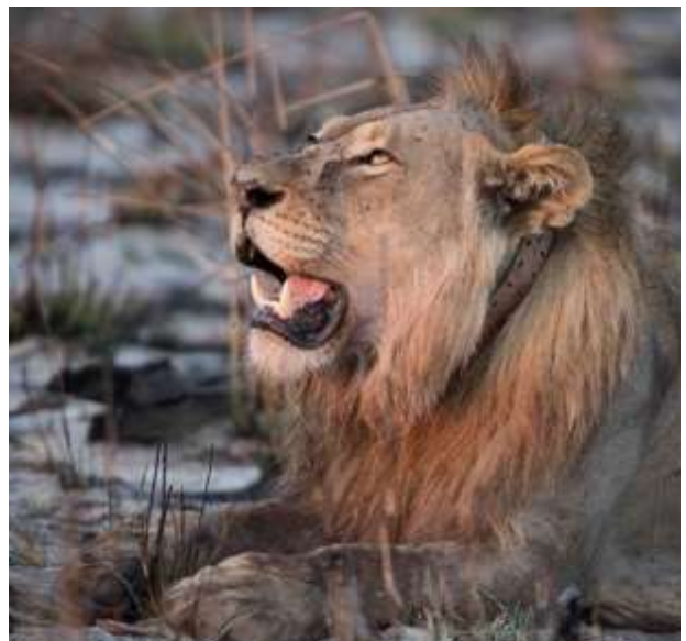
In Mudumu National Park there are 13 known lions, two adult males (above), three adult females with four cubs (centre) and three sub adult males and one sub adult female (bottom).