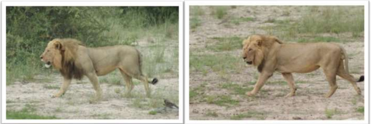
The coalition of males that took over the Mahango Pride in 2012, and that are still resident in Mahango/Buffalo Core Areas in Oct 2017.

*The Mahango lions have not been seen since June 2017 and could possibly have been poisoned or snared.