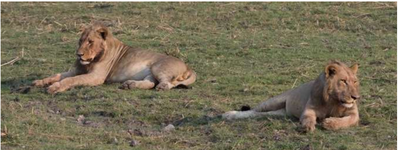
The Mparamure Pride produced four sub adult males that dispersed in early 2017, one of which was killed near Linyanti.

In August 2017 we managed to radio-collar a group of three sub adult males of about two and a half years of age in the park. It is not clear to us whether these are the same sub adult males born in the Mparamure pride (minus the dead one), or if this is a new coalition that moved into the area either from Mudumu NP or Botswana. We suspect they are the males born into the Mparamure Pride. Originally in 2015 there were five cubs, but the 5 th , which was a lioness, died. The three young males had a spate of killing many cattle in the Samudono area of Wuparo Conservancy in early 2017. This prompted the awarding of a hunting “problem lion” quota. However, since then these lions have stopped killing cattle for now and took up temporary residence in the marsh areas of Balyerwa Conservancy, occasionally in Mudumu National Park, and also crossing the Kwando River in Botswana before moving back to NRNP.