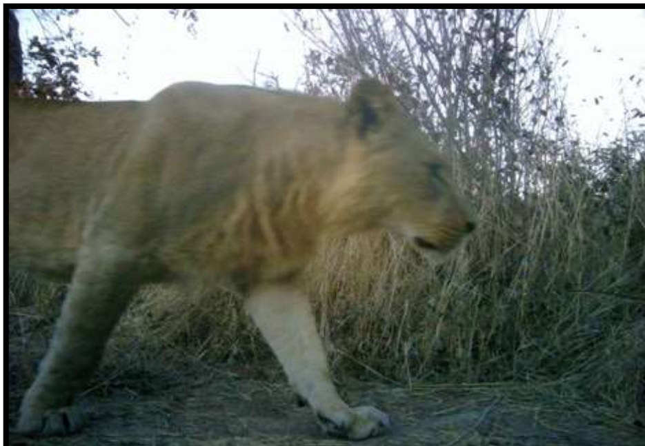
Sub adult male lion of about two years of age photographed by camera trap along the Namibia/Zambia border in the State Forest in September 2017.

The Mudumu North Complex incorporates Mudumu National Park, Kwandu, Mayuni, Mashi and Sobbe conservancies and the western extremity of the State Forest falling adjacent to the Kwandu Conservancy and south of the border with Zambia. There are no resident lions in the conservancies of the Mudumu North Complex north of Mudumu National Park. However, we recently photographed a sub adult male lion on camera trap south of the border between Namibia and Zambia in the State Forest. There have also been odd sightings of lions in this area along the tar road and east of Singalamwe. Thus although no resident lions occur here it does seem to be acting as a corridor for lions to move between Mudumu and Sioma Ngwezi National Park in Zambia.