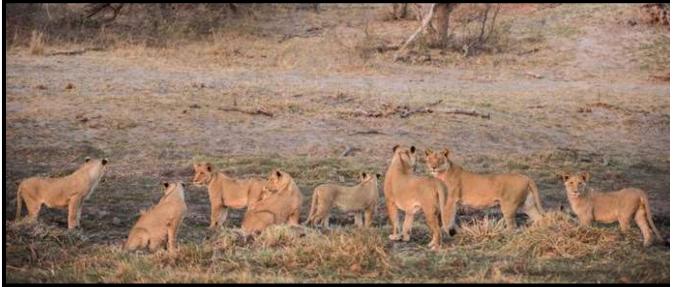
Two of the Horseshoe lionesses with their six cubs born in 2015, in Kwando Core Area, Bwabwata National Park.