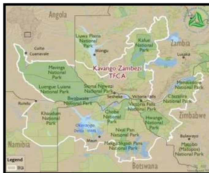
Figure 1. Map of KAZA TFCA

Combined and collated into a database, these records allow us to piece together a relatively accurate reflection at the status of the Kavango and Zambezi Regions lion population at any one time, and the changes that occur.