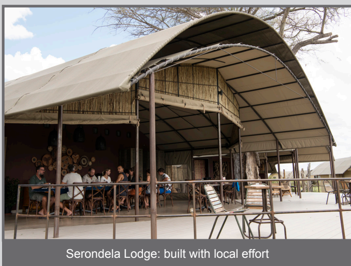
Serondela Lodge: built with local effort

“I want to go further with guiding,” he says. He knows all of the river birds and the creatures on the bank.