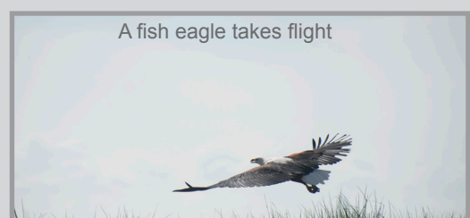
A fish eagle takes flight