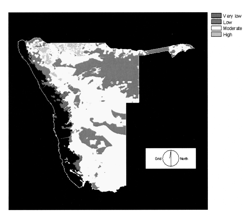
Figure 2. Land degradation risk map for 1997 based on the four indicators described.

The population pressure index has only three classes according to its definition. The class values 2 (moderate) and 3 (high) were modified to 3 and 5, i.e., moderate = 3 and high = 5. Definition of the resulting five-land degradation risk classes: very low, low, moderate, high and very high is given in Table V.