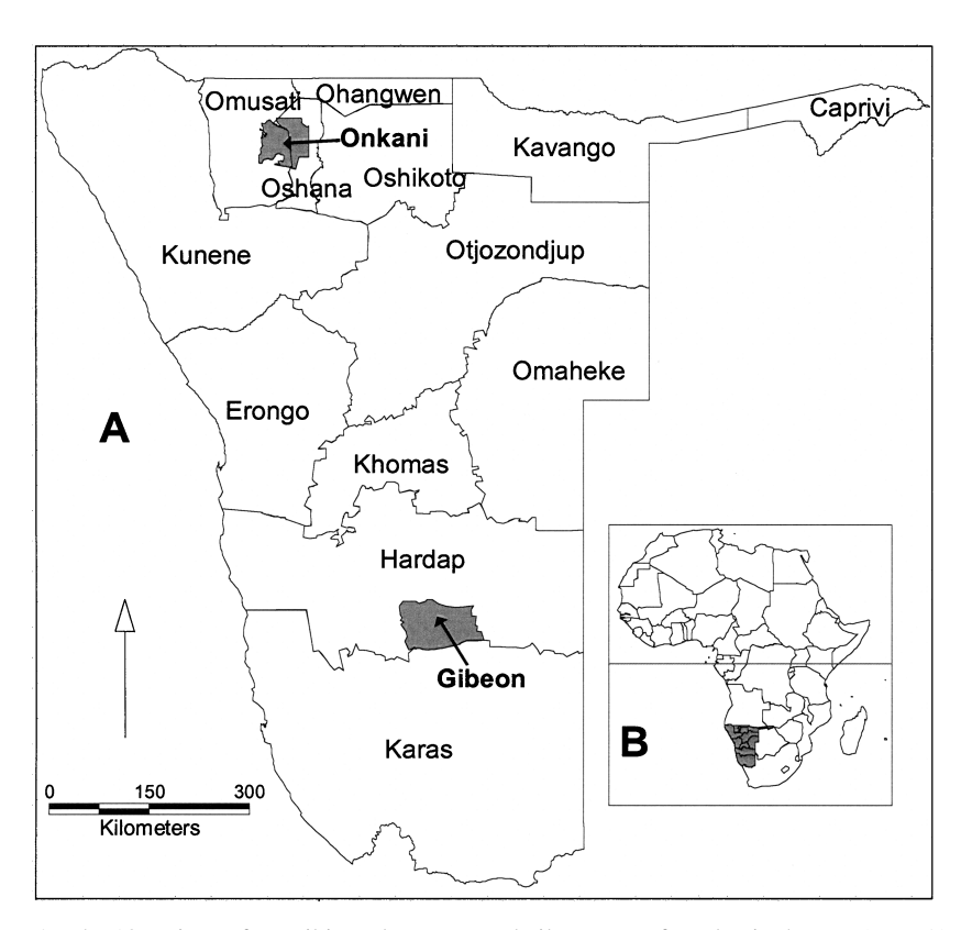
Figure 1. The 13 regions of Namibia and two Napcod pilot areas referred to in the text (Map A). Map B shows the location of Namibia on the African continent.

government and can be used by anyone, but with no exclusive rights. Commercial, freehold land is owned by individuals with exclusive rights. The population of 1.8 million is relatively small but growing rapidly at an annual rate of 3.1% (Central Bureau of Statistics, 1994). The population increase has led to higher pressure on the country's natural resources (Seely et al., 1995). This is evident in communal tenure areas, where land degradation is a growing problem (Adams and Devitt, 1992; Quan et al., 1994b; Seely et al., 1995; Wolters, 1994). According to Seely and Jacobson (1994), proximate causes of land degradation in Namibia include both biophysical and land management factors. Non-adaptive management in a highly variable climate is seen as a major cause of land degradation (Naraa et al., 1993; Van Warmelo, 1962). Seely and Jacobson (1994) state that reduction in vegetation cover and subsequent soil denudation following intensive grazing can be found in all regions but in particular, in the Erongo, Kunene and north-central regions (Figure 1). Sullivan has recently challenged these views on the basis of a study in Kunene, north-western Namibia, concluding that land degradation is not as widespread as commonly perceived (Sullivan, 1998; Sullivan, 2000). A recent