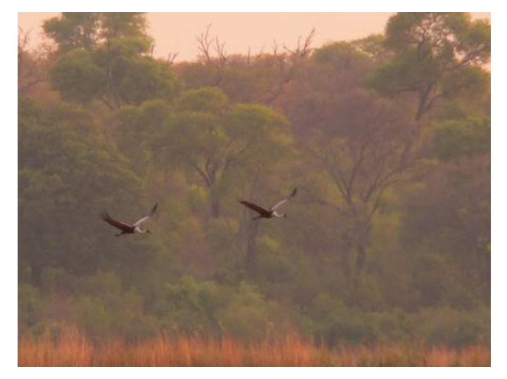
However as the sun set and we returned to our camp we had counted just over 100 species for the day. A special highlight was a juvenile martial eagle which landed clumsily

By now we had seen so many birds each day that we decided on a challenge for the next day, i.e. to clock up 100 birds for that day. Early in the morning we began counting. Mahango Game Reserve was on the itinerary and by the time we reached Kwetche we had already totaled 50 bird species. Piece of old cake I thought, but it proved to be far more difficult to get the second fifty together.