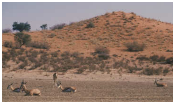
Lightly vegetated red Kalahari dunes

The Kalahari is the most recent large-scale geological landform of the southern African subcontinent. Overlying ~ 280 - 180 million year old sediments and volcanics of the Karoo era, it is characterised by dunes, pans and dry "river valleys" ( omurambas ), by which the area is drained after erratic rainfalls. The Kalahari sediments, which consist of variably consolidated sands, clays and gravels, vary greatly in thickness, reaching up to 600 m in the Owambo Basin of northern Namibia. Often the soft sediment is cemented by microcrystalline calcite into calcrete, which forms in regions where evaporation exceeds precipitation.