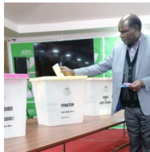
IEBC Conducts Voting Simulation