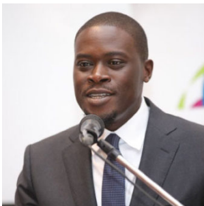
Sakaja Urges Kenyans To