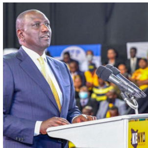
Ruto Urges Kenyans To Maintain Peace