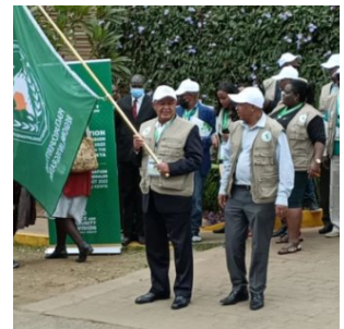
IGAD Deploys Election