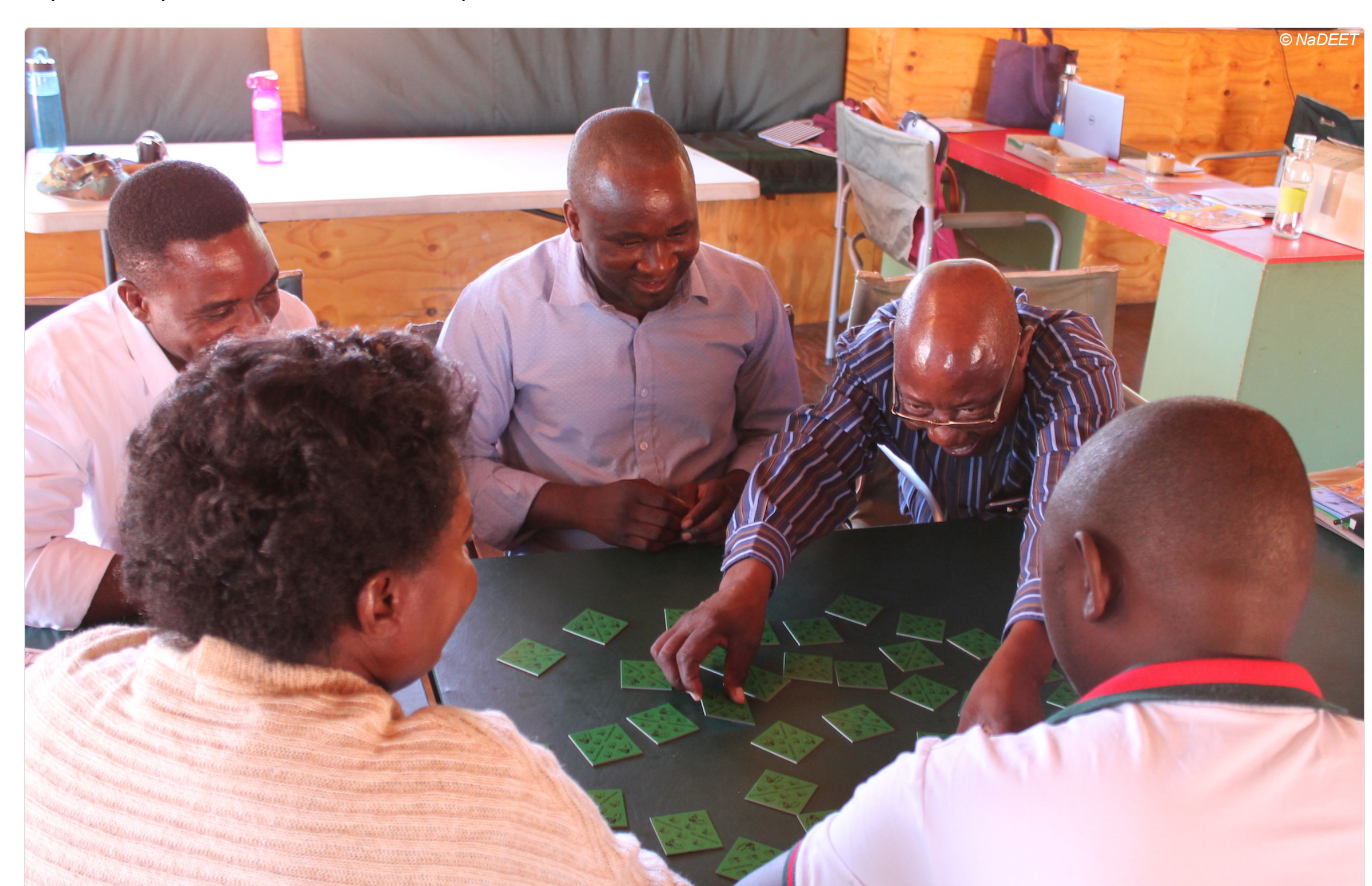
Teachers developed memory card games linked to the It's Time to Grow booklets that they can play with their pupils.

Through this project we aim to change the way people think and empower them to work towards a sustainable future. It's Time to Grow helps reach this goal using mother tongues. It allows children to combine learning about numbers, shapes and colours in the lower primary curriculum with environmental topics. Learners acquire knowledge and develop skills in recycling and water saving, the importance of energy as well as personal growth through storytelling, games and puzzles. Furthermore, this material uses local examples and artwork that learners can relate to while being made aware of important aspects of sustainable development.