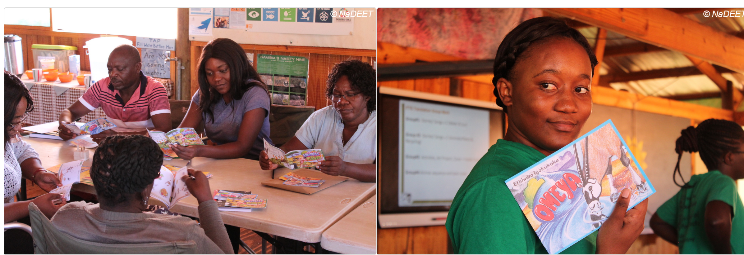
NaDEET brought teachers from all over Namibia to translate the It's Time to Grow booklets into their mother tongues.

A Quality Education Platform hosted jointly by the University of Namibia and UNESCO focusing on Education for Sustainable Development and mother tongue instruction in schools inspired NaDEET’s Director to translate and reconceptualise our It’s Time to Grow booklets. The new project also aimed to integrate various components of NaDEET’s work to improve the overall impact. As part of our new approach we trained lower primary school teachers in Education for Sustainable Development concepts and invited them to translate the booklet series into their own mother tongues. This doubled our impact by increasing teacher ownership over the environmental literacy material.