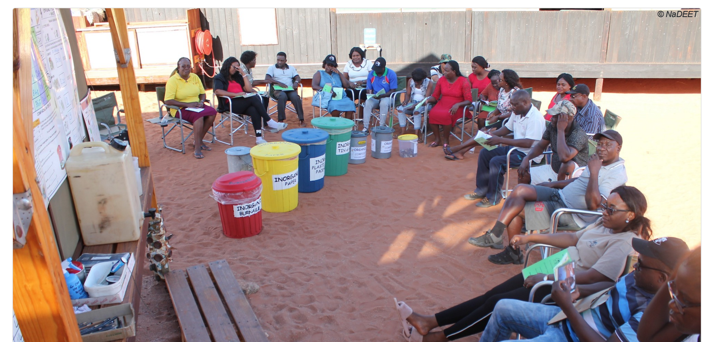
A group of teachers hosted at the NaDEET Centre learn more about recycling to pass on to their pupils.

Combining translation of the booklets with the workshops helped build capacity among lower primary teachers to teach their learners the Environmental Studies curriculum in their respective languages. Overall it was an empowering experience, as participants not only learnt about how to practice sustainability, but also broadened their vocabulary for teaching about sustainability their own languages. During translation it became clear that a concept such as recycling is not used in everyday conversation in many local languages. Therefore it was important that the teachers not only translated but also learnt in depth what these concepts mean.