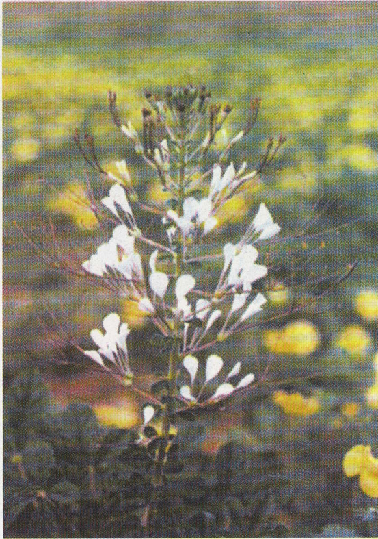
Figure 1. Cleome gynandra