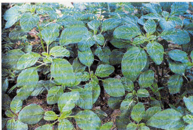
Figure 3. Seedlings of Amaranthus thunbergii .

Like C. gynandra , Amaranthus spp. also use the C 4 carbon fixation pathway which makes them adapted to high light