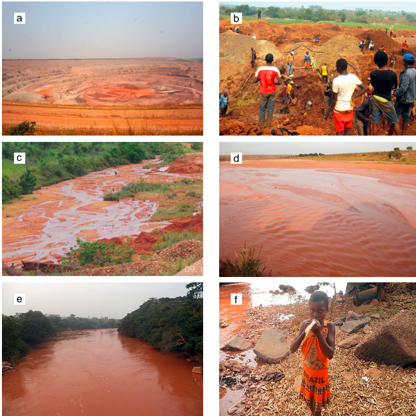
Figure 3: (a) industrial mining; (b) artisanal mining; (c) river deviation and artisanal mining along a riverbed; (d) silted river; (e) increased turbidity in river water; (f) consumption of turbid and untreated water.

Table 1 shows the land use evolution of a part of the Cuango municipality from 2005 to 2015, with respect to the areas occupied by vegetation, urbanisation, and mining activities. Notably, the increase in areas affected by mining is still larger in other municipalities (e.g. Cambulo), which implies a larger loss of natural vegetation cover there.