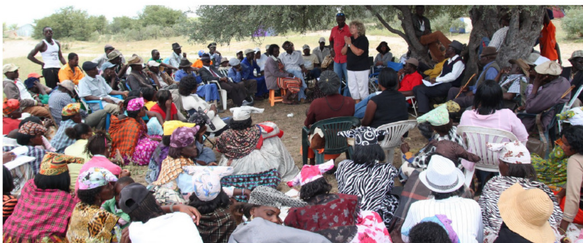
Devil's claw training in Orupupa Conservancy

(see under Agriculture/Indigenous Natural Products)