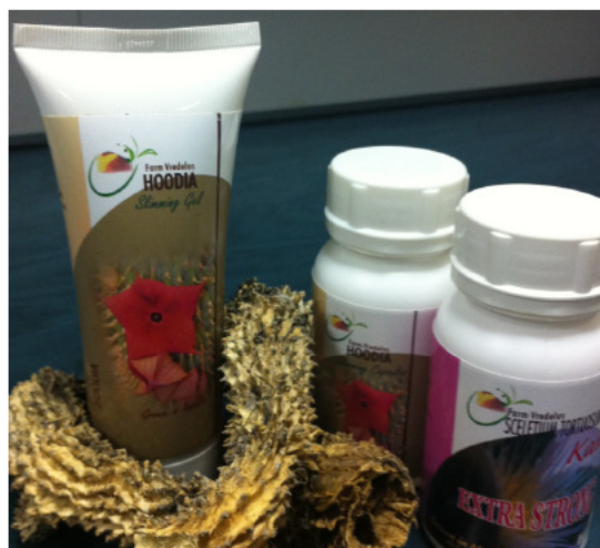
Hoodia and kanna ( Sceletium ) products

Hoodia was once a promising poverty alleviation prospect, especially in southern Namibia, and at one stage more than 300 people were involved in the cultivation of the plant. Today, only three farmers are cultivating and marketing hoodia, and they only harvest and sell whenever there is an order. The Ministry of Environment and Tourism issued 91