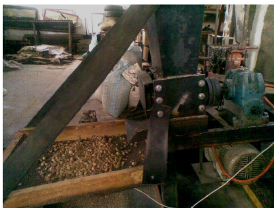
Decortication trials conducted by PhytoTrade Africa

This project has three focal areas. The first has investigated improved processing technologies for four indigenous Namibian oils: Schlerocarya birrea (marula); Schinziophyton rautanenii (manketti or mongongo); Ximenia americana and X. Caffra (blue sour plum); and Citrullus lanatus (Kalahari melon). On the basis of the research results, a new hydraulic press has been acquired so that further controlled extraction parameters can be established. By the