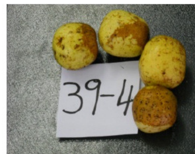
Identification of marula batches