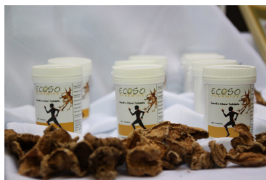
EcoSo devil's claw tablets

EcoSo Dynamics CC, the applicant for the Grant, has teamed up with EU-based experts in order to investigate the regulatory requirements that must be