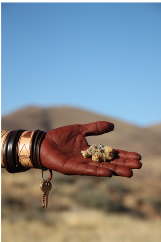
Omumbiri : "A handful goes a long way"

Tucked away in the northwest corner of Namibia is Kunene Region, an arid environment that is home to the nomadic Ovahimba people and the range of many endemic plant species. Products from two such plants, Commiphora wildii and Sarcocaulon mossamedes , are currently being developed; the plants are sustainably harvested and traded, mainly