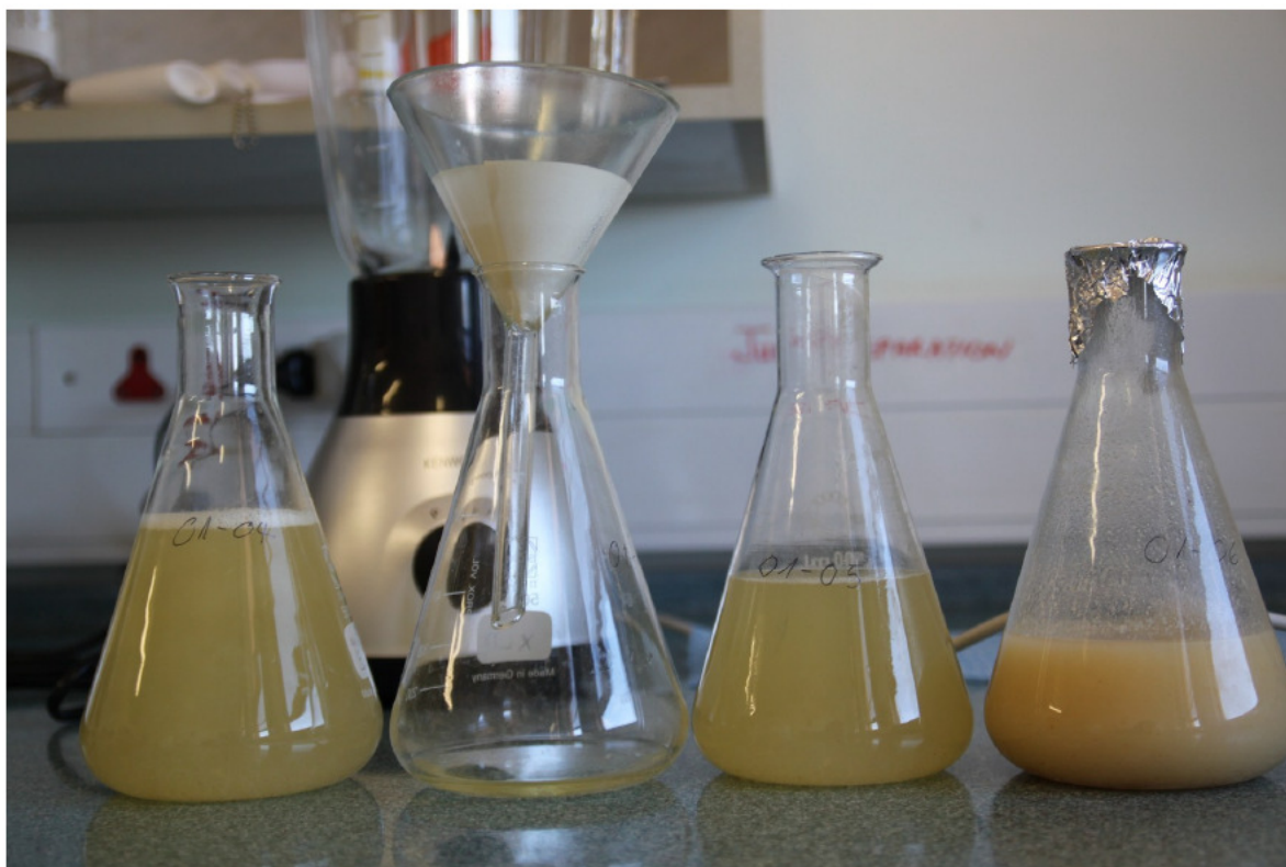
Marula juice analysis

The project team successfully produced 400 samples from 50 trees, recorded a large data set, and evaluated the data.