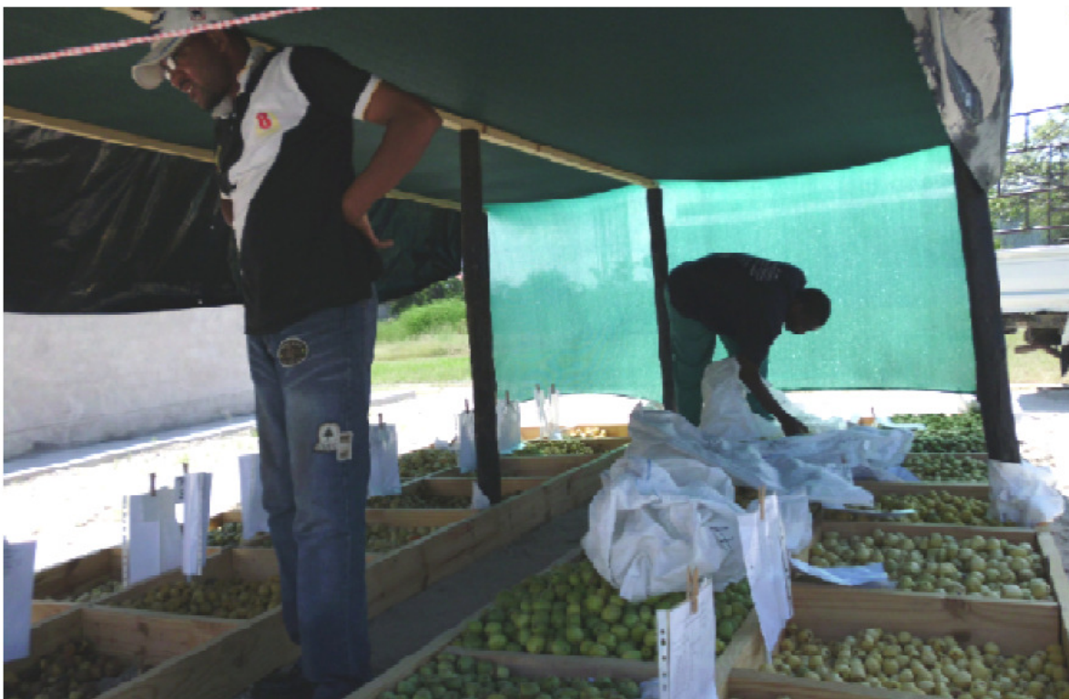
Batches of marula stored for analysis

The data evaluation successfully identifies the marula fruit chemical and physical changes through eight days of ripening. These data are correlated with traditional knowledge regarding fruit and produce characteristics at a clear definition of ripening. The correlation of chemical parameters of ripening with local knowledge forms the basis upon which to develop industrial supply chains of marula fruit.