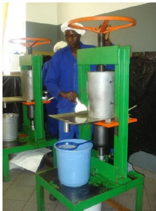
Marula oil press

MARULA FOOD OIL: Marula food oil is yet to be launched in the formal market, although the product is already sold to consumers in the north-central regions from the EWC factory in Ondangwa. In Windhoek, a 500 ml bottle of marula food oil currently sells for N$94, and a 250ml bottle for N$50.