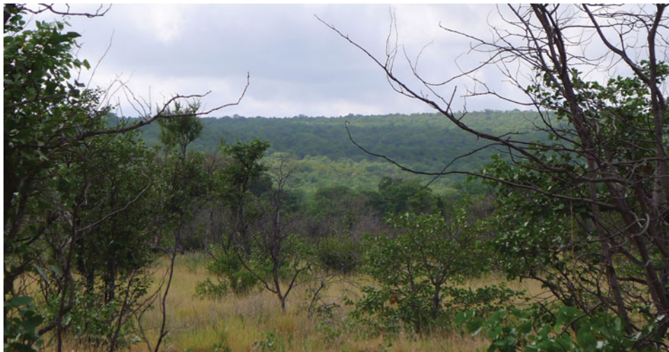
Figure 4. Kruger's expansive, dense terrain. Photo taken by author, 2012, near the Mozambican border. (Color figure available online.)

topography. At almost 2 million hectares and taking two to three days to cross on foot from east to west, Kruger's landscape is indeed vast. In addition, much of the park, including much of the border, is a heavily forested landscape of mixed woodland and Mopani bushveld that is especially thick with vegetation in the rainy season (Figure 4). Much of the border also includes the undulating and rocky Lebombo Mountains, which makes for "ankle-breaking" patrols. These qualities together leave the park difficult to patrol, enabling rhino poaching teams to slip in and out of the park often undetected (Interviews 2012). Due to budget restrictions, as of mid-2013, Kruger had fewer than 500 rangers, which, due to the park's size, amounts to approximately one ranger per 4,000 hectares. These qualities of expansiveness and obscurity, in fact, frequently characterize conservation areas around the world, making them difficult to patrol under normal conditions, let alone during times of commercial poaching.