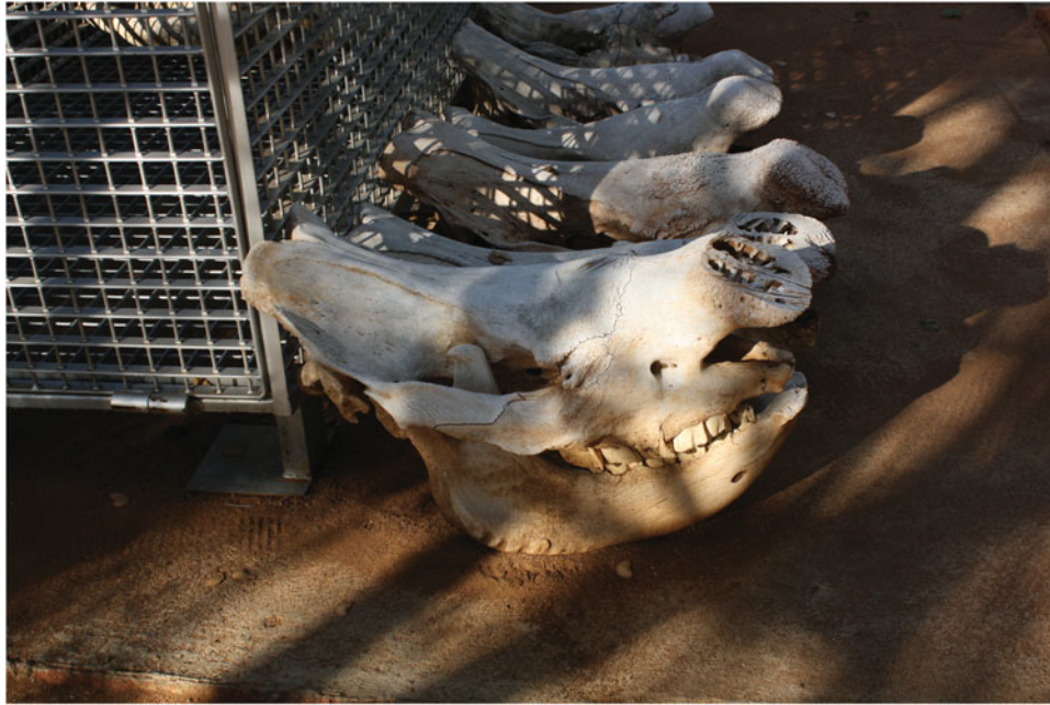
Figure 5. Kruger's vast and dense terrain articulate with the biophysical properties of rhino horn (quick and easy removal) to confound antipoaching efforts. The clean cut across the nose of the skull in the foreground indicates the rhino was killed for its horn. Photo by author, 2009, at one of Kruger's section ranger headquarters. (Color figure available online.)

Group, a state-owned aerospace and defense conglomerate that has loaned an unmanned aerial vehicle, Seeker 2, a drone, to SANParks to assist its anti-poaching efforts. "Details of the intervention," we are told, "cannot be released for security considerations and other key operational sensitivities" (SANParks and Denel 2012). At a minimum, this "intervention" brings military drone technology into Kruger—technology that can potentially lessen the problems of distance and invisibility posed by the park's expanse and dense topography. In a far more well-publicized partnership, SANParks has received additional military aerial surveillance technology from the Ichikowitz Family Foundation, which is the charitable arm of the Paramount Group, itself the continent's largest privately owned defense and aerospace company. Their donation consists of a Seeker Seabird specialist reconnaissance aircraft equipped with a "FLIR Ball infrared detector [that] will deliver more enhanced and powerful observation capability to [Kruger's] rangers, making it very difficult for poachers to hide" (SANParks 2012a).