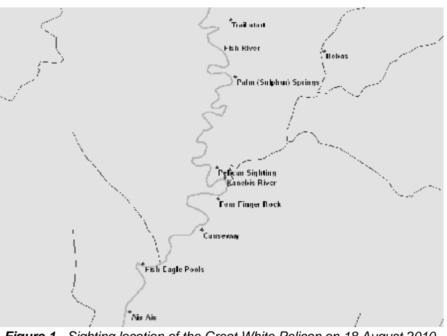
Figure 1 - Sighting location of the Great White Pelican on 18 August 2010 in the Fish River Canyon National Park, Namibia.

Usually gregarious, resident, but subject to irregular movements and dispersal, most P. onocrotalus remain within 200-300 km of their breeding sites, although they may wander occasionally more widely, usually in groups (Crawford 2005).