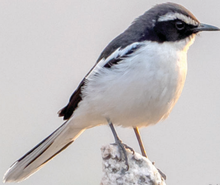
Angola Cave-Chat Xenocopsychus ansorgei