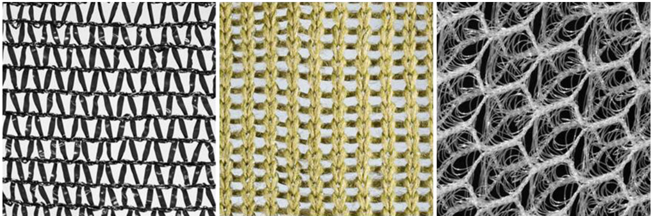
Fig. 2 Three mesh types for fog collection. The Raschel mesh (35% shading, left panel , www.marienberg.cl ) has been successfully applied for many years in 35 countries in five continents. It is used double layered in SFC and LFC (only one layer is shown here). The middle panel shows a robust material with a stainless mesh, co-knitted with poly material ( http://www.meshconcepts.co.za ), which has been

employed in South Africa. The right panel shows a newly proposed design of a three-dimensional net structure (1-cm thickness) of poly material ( http://www.itv-denkendorf.de ). Note that no overall comparison of mesh collection rates and technical performance has been conducted yet. The edge lengths of mesh sections shown are 6.5 cm