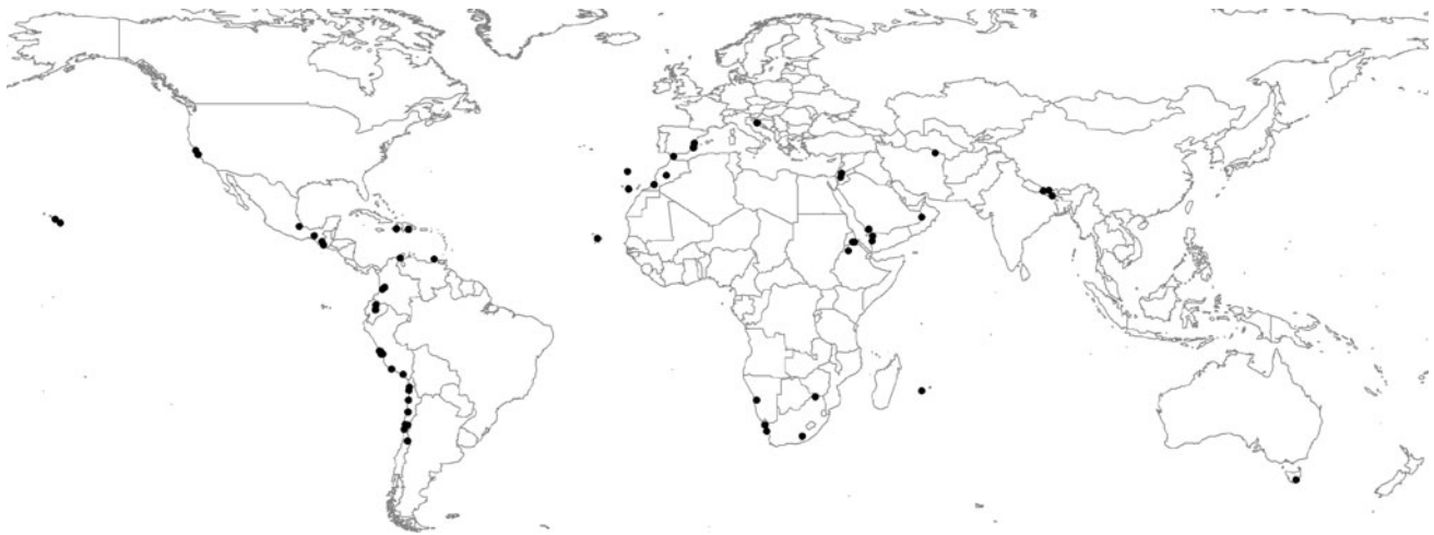
Fig. 3 Map with locations marked that were successful, are successful, or bear the potential for being successful in collecting fog for the production of fresh water in arid or seasonally arid regions. The potential must have been proven by an evaluation project

More projects in Chile were realized in Padre Hurtado (31.5° S, Osses et al. 2000), providing water for visitors to a church sanctuary and for gardening between 1999 and 2004, in Peñablanca (29° S), where the fog water is used for afforestation with native trees and for environmental education, in Falda Verde (26° S, Larrain et al. 2002; Carter et al. 2007), delivering water mainly for Aloe Vera fields between 2001 and 2010 and now being operated as a demonstration project, and in Alto Patache (21° S, Larrain et al. 2002, Calderón et al. 2010), which is a site primarily used as a platform for ecosystem and climate research. It has an SFC fog collection record for 14 years, with average fog collection rates of about 6 L m -2 day -1 .