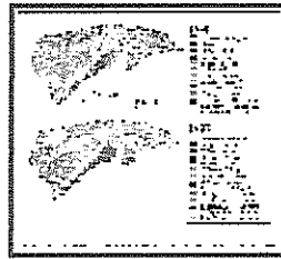
Fig.3. Areas which burned in East Caprivi during 1996 and 1997. Seven percent less was found to have burned in 1997, the year when most fire lines were cut by the community-based fire control project.

1996, against a 8% increase in the area burned over the same two year period in west Caprivi. This supported the proposition that the fire lines had a positive effect in reducing fire extent. However, the assessment would be improved markedly by combining the maps in Figure 3 with an accurate map of the fire lines cut and by mapping burns over additional years to better understand normal variation. Additional work is planned to map susceptible areas with high fire frequencies by mapping additional burn years.