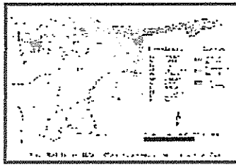
Fig.1. Areas of northern Namibia which burned during 1997