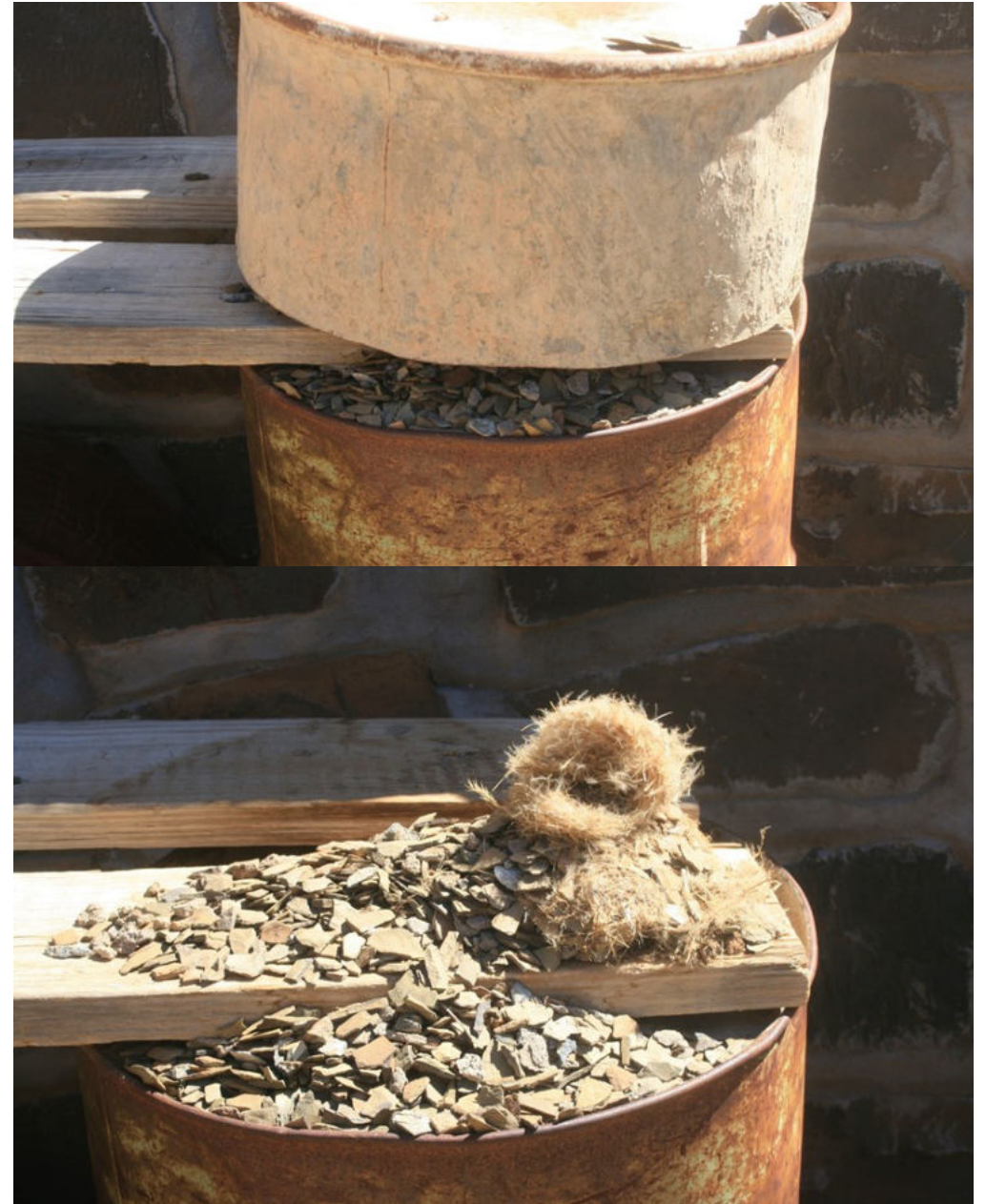
Figure 4: Nest in old building (outdoors) – covered by drum (above) and exposed (below). This nest had 2 cups, one partially covered by stones.

According to Steyn (1966) the stones selected as base material weighed between 5–6 g (maximum 7.5 g); they were elongate and flat in shape and varying in length and width from 38–48 mm and 11–20 mm, respectively. The shape of the stones selected was thought to be best for transporting in their bills. Plowes (1943) and Taylor (1936) indicate that pebbles, earth clods and plaster are also used as foundation material.