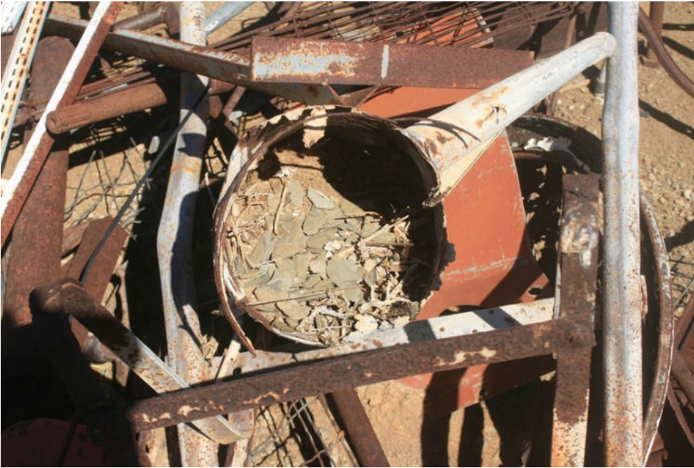
Figure 3: Old watering can on rubbish dump (outdoors). This nest was built on an old tractrac chat nest.

the actual scale of constructing these foundations, is impressive, but has not been previously been well described. Steyn (1966) refers to the foundation as the base with one nest having a moderate base while another was more extensive and comprised of 147 small stones, with 50 additional stones added the following year, as a new base covering the old nest cup. However, not all nests were constructed with stone foundations and were dependent on the nature of the site.