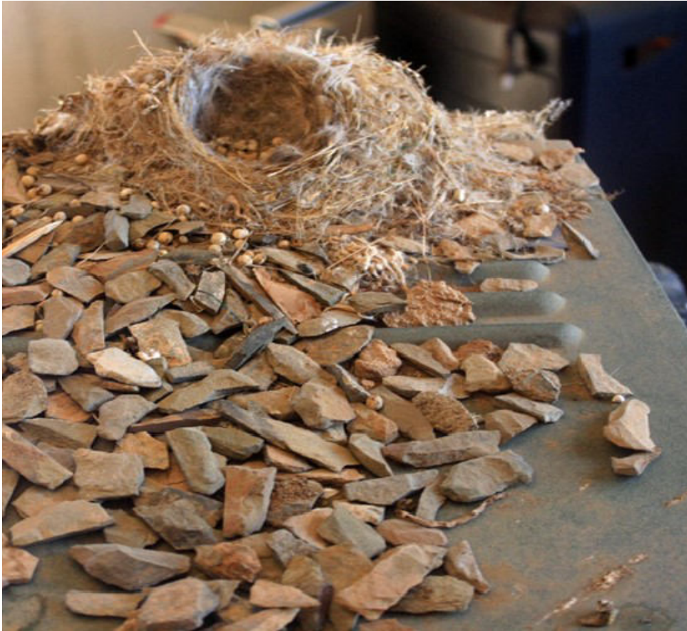
Figure 1: Nest under shelf in generator room (indoors).