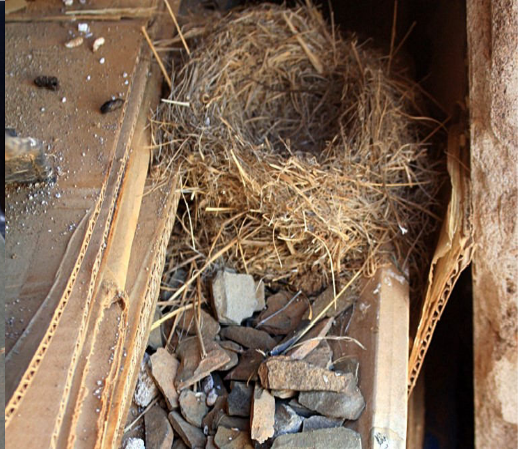
Figure 2: Nest on boxes in garage (indoors).