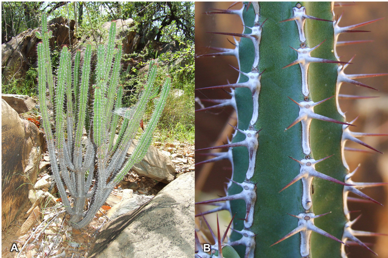
FIGURE 1. Euphorbia otjipembana subsp. okakoraensis : (A) plant in natural habitat, \pm 0.8 m tall; (B) branch indicating spine shields.

Type: —NAMIBIA. Kunene Region: Stony northeastern slopes of Okakora Mountains near Okombambi, 1712BB, 930 m, 24 March 2007, Swanepoel 271 (holotype WIND!; isotype PRE!).