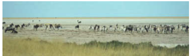
Zebras grazing along the fringe of the Etosha Pan

Lying some 1100 m above sea level, the Etosha Pan, which is surrounded by extensive grass and thornbush savannah, forms the lowest point of the Owambo Basin - a large intracontinental depression floored by more than 1000 million year old rocks of the Congo Craton and containing some 8000 m of sediments. The immediate bedrock of the pan consists of silts and sands of the Andoni Formation and Etosha limestone, which belong to the young (< 65 million years) Kalahari Group. Only the uppermost layers of this pile are subjected to alteration by recent flood waters, and exhibit a mineral assemblage characteristic of saline-alkaline environments (similar to the East African salt lakes), including analcime, K-feldspar, sepiolite, saponite, calcite, dolomite, strontianite and various salts. Although shades of off-white are the predominant “colours”, large parts of the pan surface display a distinct green-gray hue, which is caused by the micaceous mineral glauconite.