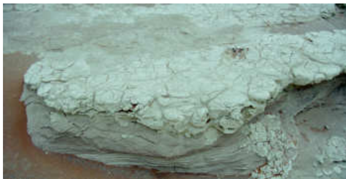
Mud cracks characterize the fine-grained pan sediments

“Lake Etosha” was formed 5 to 7 million years ago by a drainage system involving the upper Kunene and Okavango Rivers. At the time of its maximum extent it covered an area of 55000 km 2 . When a westward flowing river captured the headwaters of the Kunene ca. 2 m. y. ago, “Lake Etosha” was cut off and began to die. As it shrank through continued evaporation under increasingly dry climatic conditions, the Cuvelai System with its oshanas (small seasonal rivers) developed in its place. Stromatolites, formed by carbonate precipitation through the activity of micro-organisms, are indicative of a lacustrine environment supersaturated with carbonates, as is typical for an evaporating inland waterbody. Eventually a pan formed which only seasonally holds water. Erosion set in, with fluvio-lacustrine processes in the rainy season and aeolian deflation during the dry season, the latter creating the prominent dunes north-west of the pan.