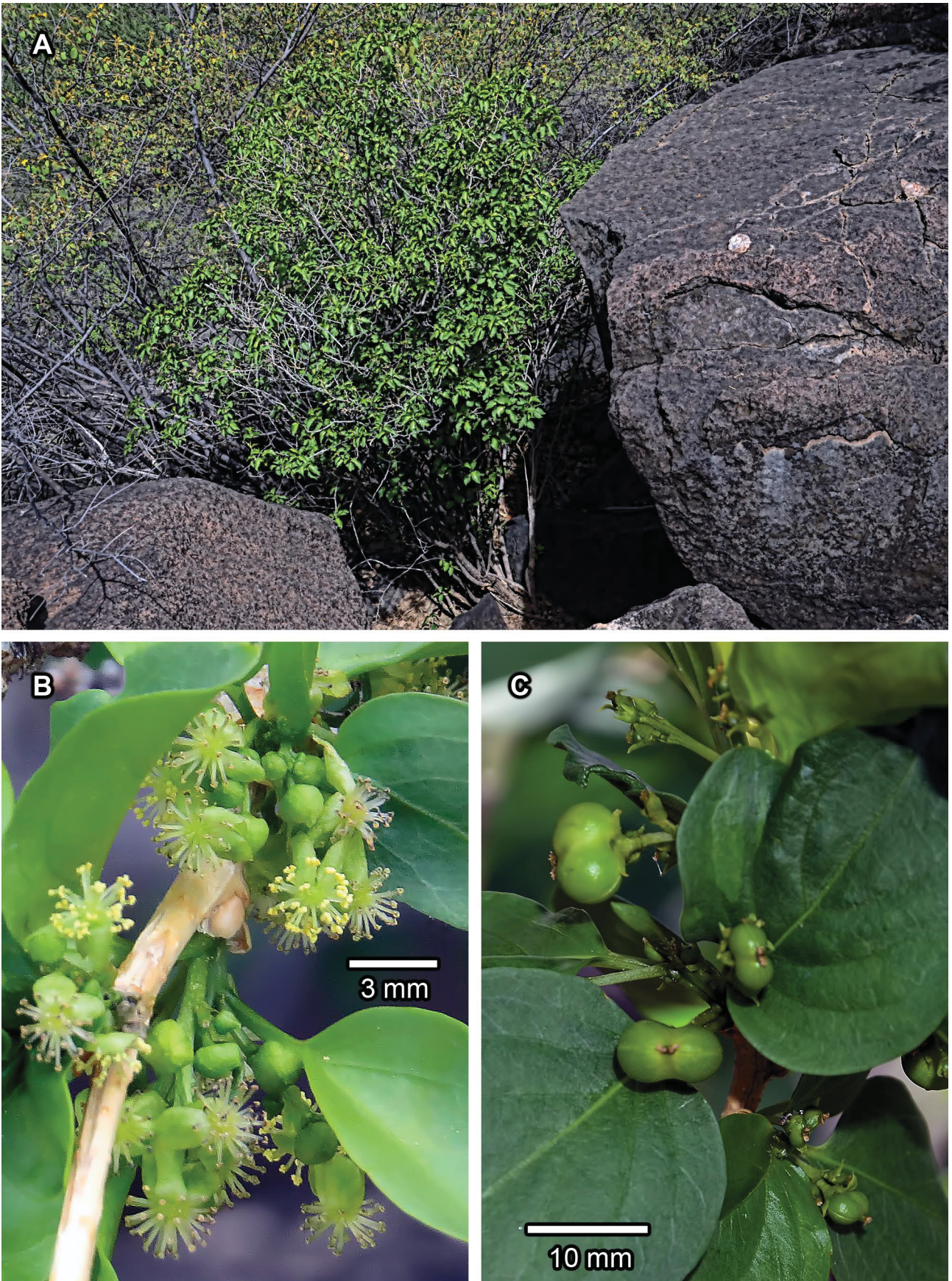
FIGURE 2. Erythrococca kaokoensis . A. Plant in natural habitat (Zebra Mountains, Namibia) among greyish black boulders of anorthosite, growing as a shrub about 2 m tall. Associated shrub with smaller leaves and yellow flowers in background is a species of Grewia . B. Male flowers. C. Female flowers and immature fruit.