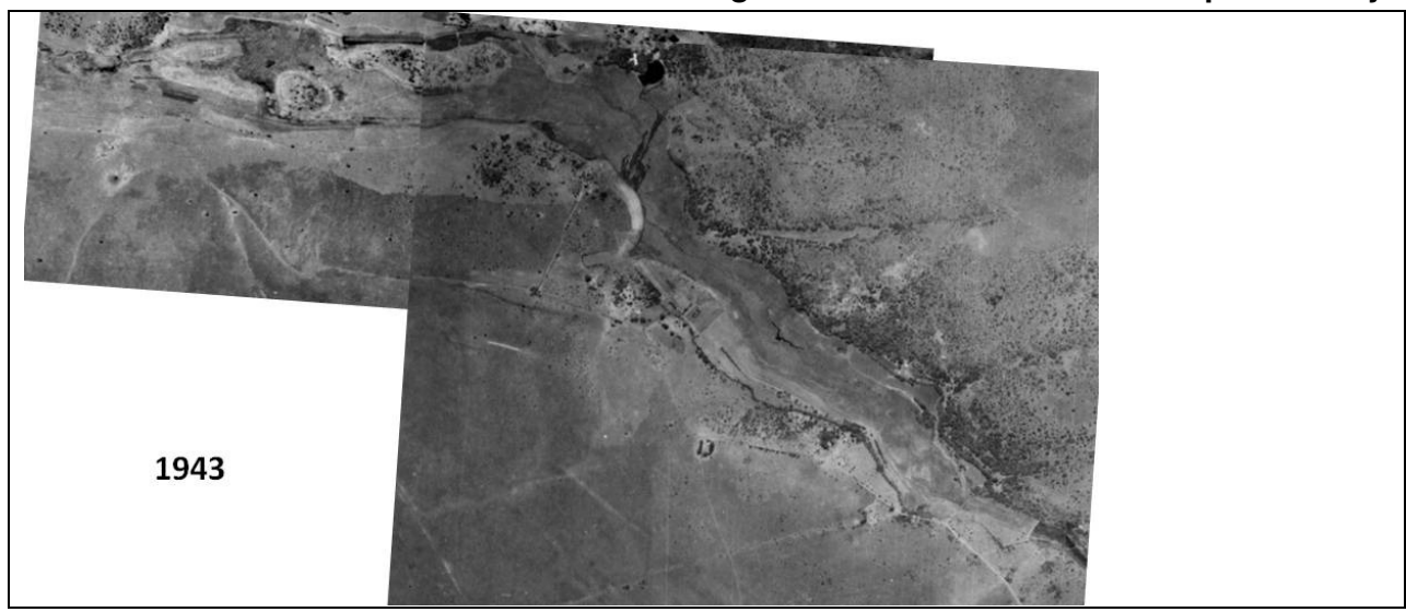
Table 10.1 Reduced flows in to the wetland and disturbance within the wetland has reduced the area of reeds and other natural vegetation between 1943 and the present day

A monitoring programme for the above would need to be developed since baseline data to address the above were not collected as part of the routine EFR assessment.