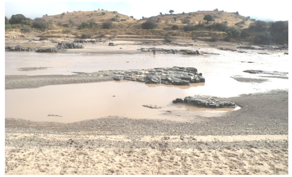
Figure 8.1 The bed at this site is being smothered by fines deposits. This is reducing inchannel habitat diversity.