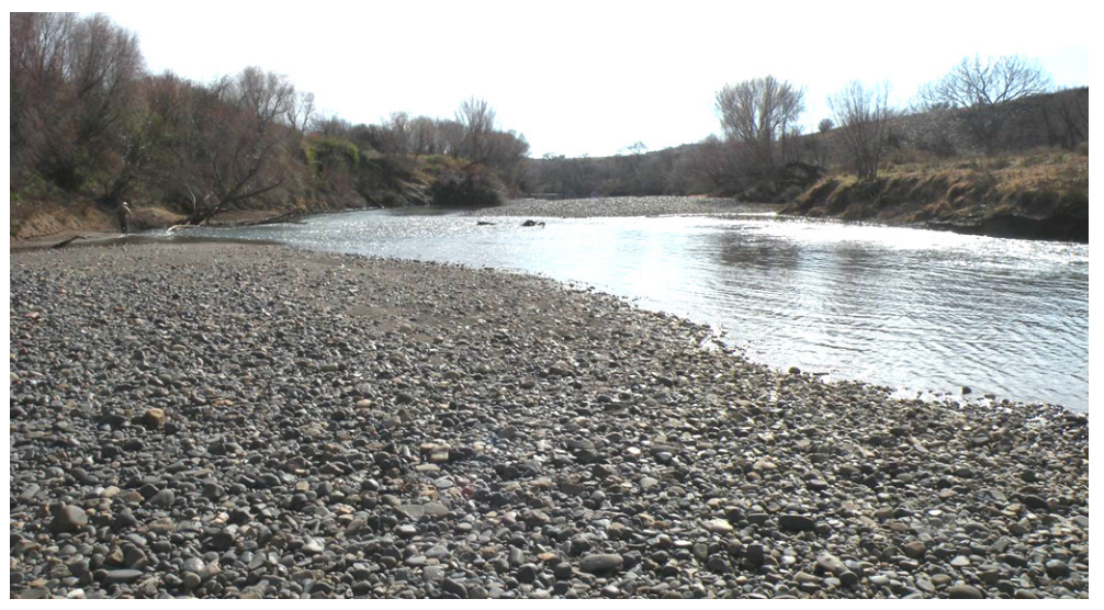
Figure 9.1 This pool-riffle reach comprises mobile well-sorted cobble and gravel beds. The reach is considered to be close to the Reference conditions.