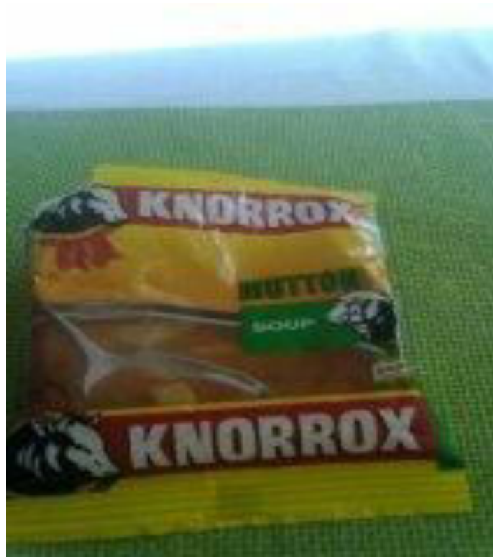
Figure 4: alternative feed for the invertebrates.

After approximately 3 weeks of growing the invertebrates in the tanks, easily collected with a very fine mesh sieve and placed in 50ml tubes where 25ml of 70% ethanol was added for preservation purposes.