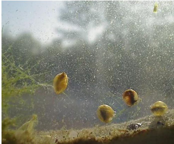
Figure 7: conchostraca swimming near the bottom of the flask