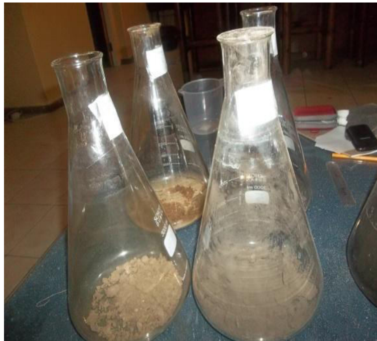
Figure 2: substrate samples