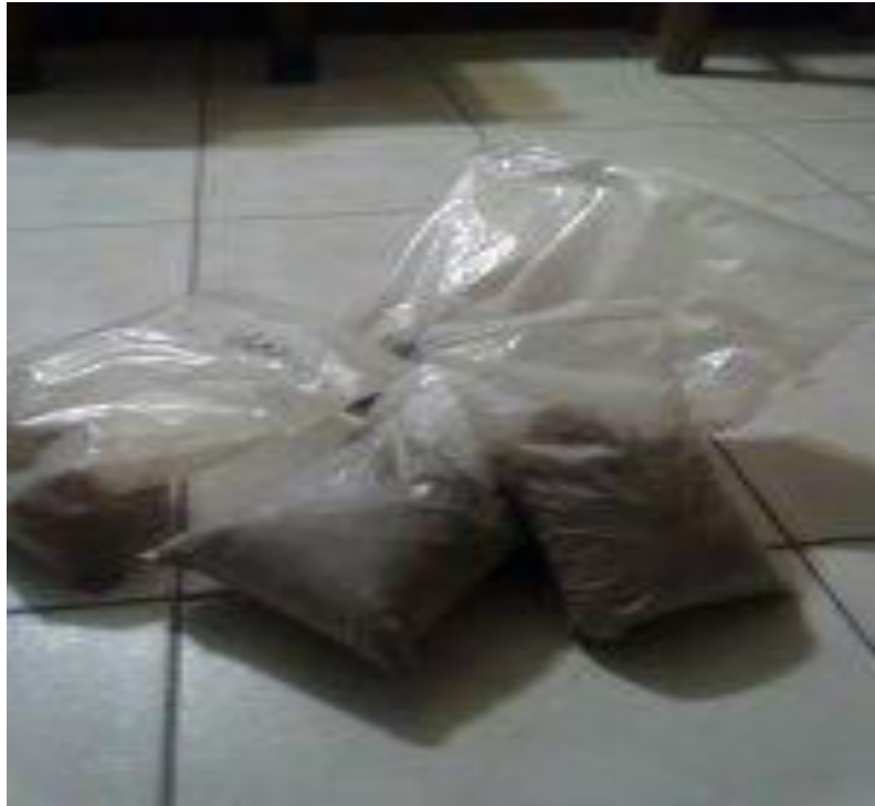
Figure 1: substrate samples

Erlenmeyer flasks (Figure 2 & 3) that were filled with 2litres of rain water. These flasks were kept against a glass door or a window to expose the flasks to sunlight.