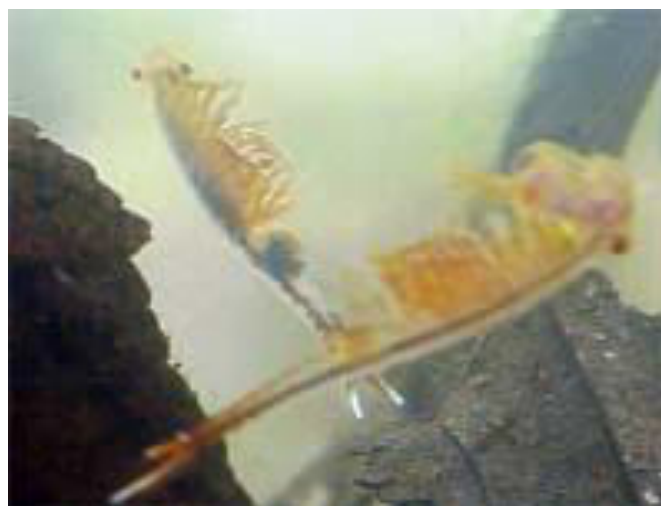
Figure 6: female and male anostracha species in their typical swimming position