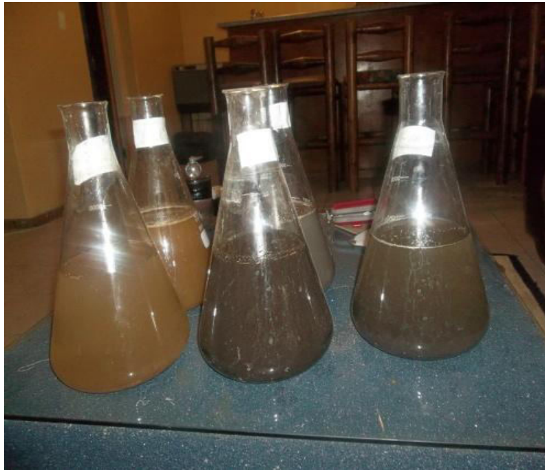
Figure 3: Rain water added to substrate

Rain water was regularly added to the flasks to maintain the water level at 2liters per flasks. The tanks were stirred twice a day, in the morning and before sunset, to mix the substrate well with the rain water. Observations were conducted twice a day, in the mornings and before sunset.