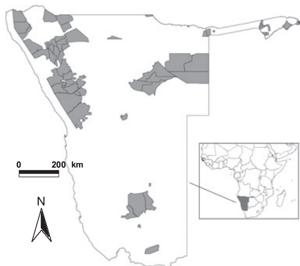
Fig. 1. Namibia, with location of communal conservancies indicated by shaded polygons.

Our study area was the set of customary landholdings that have been registered as communal conservancies in Namibia, an arid country in southern Africa (Fig. 1). Progressive legislation during the 1990s devolved conditional rights to benefits from natural resources to local communities; prior to this, they had been the property of the national government. In exchange for these rights, communities are required to register their customary landholdings as conservancies, i.e. locally-managed units that have defined boundaries, management goals, and verified plans for the sustainable harvest of wildlife and other natural resources. In terms of financial value, the dominant benefits generated by these conservancies are trophy hunting and ecotourism, which