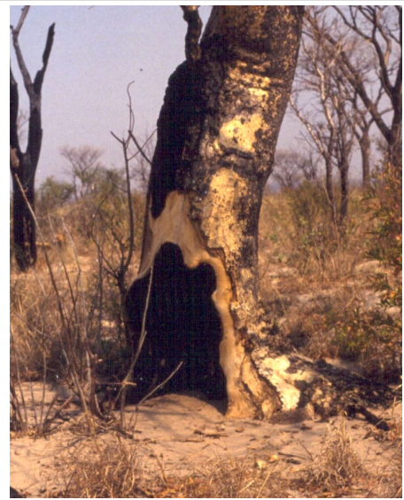
Figure 1: Characteristic fire lesion on the base of the trunk of S. rautanenii trees.

In north-eastern Namibia fire damage, in the form of hollow stems, can frequently be observed on the trunks of large S. rautanenii trees, while smaller trees show such damage much less often. The hollow is usually open at the base showing a characteristic inverted 'U' shape, such as shown in Figure 1.