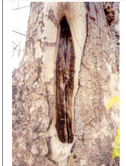
Figure 2: Fire lesion on trunk of S. rautanenii tree showing vertical splitting, charring and cavity development

During a field visit to a stand of S. rautanenii trees it became evident that many trees have multiple trunks, joined at the base. As the crown carried by such trunks grows progressively heavier, the trunk starts to develop vertical checks and splitting, (see Figure 2). Once a certain mass threshold is exceeded, the trunk breaks off from the remaining tree and collapses. This is clear from Figure 3, showing the opposite side of the trunk in Figure 2.