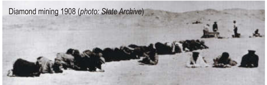
Diamond mining 1908

The alluvial diamonds found along the Atlantic coast originate in the southern African hinterland, where they formed at great depths under immense pressures before being brought to the surface in so-called „kimberlite pipes“. Leached from these kimberlites millions of years ago, the erosion products were transported downstream by the Proto-Orange River, which deposited some along its banks en route to the Atlantic - today diamond-bearing terrace gravels are mined at several localities along the Orange. Upon reaching the sea, the diamondiferous sediment was caught up by northward moving long-shore currents, which distributed the precious stones along the coast in a 100 km long narrowing zone. Concomitant with the width of the diamond-bearing sediments (3 km in the south vs. 200 m in the north), the size of the stones decreases in a northerly direction, in accordance with a weakening southerly current.