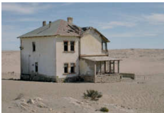
Erstwhile mine manager's residence at Kolmanskop

The alluvial diamonds found along the Atlantic coast originate in the southern African hinterland, where they formed at great depths under immense pressures before being brought to the surface in so-called „kimberlite pipes“. Leached from these kimberlites millions of years ago, the erosion products were transported downstream by the Proto-Orange River, which deposited some along its banks en route to the Atlantic - today diamond-bearing terrace gravels are mined at several localities along the Orange. Upon reaching the sea, the diamondiferous sediment was caught up by northward moving long-shore currents, which distributed the precious stones along the coast in a 100 km long narrowing zone. Concomitant with the width of the diamond-bearing sediments (3 km in the south vs. 200 m in the north), the size of the stones decreases in a northerly direction, in accordance with a weakening southerly current.