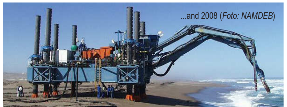
...and 2008