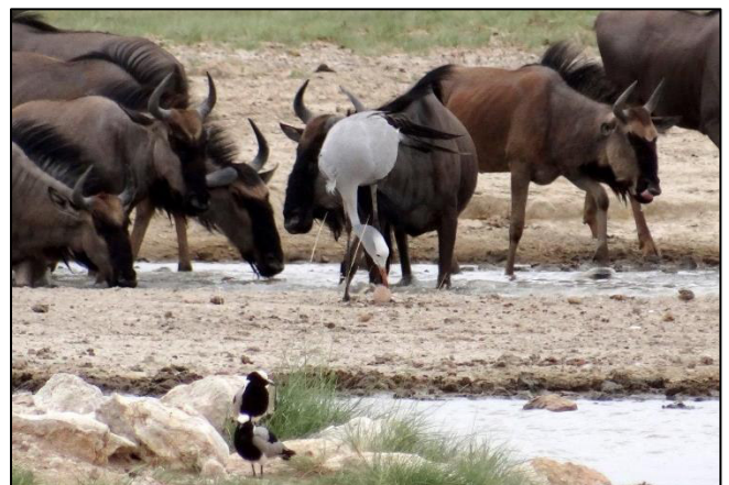
First breeding attempt recorded at Andoni waterhole in the north of Etosha