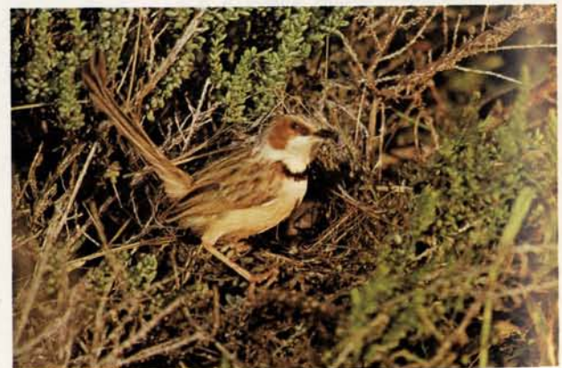
Plate 3: Rufous-eared Prinia Malcorus pectoralis etoshae at nest near Okondeka, February 1976.