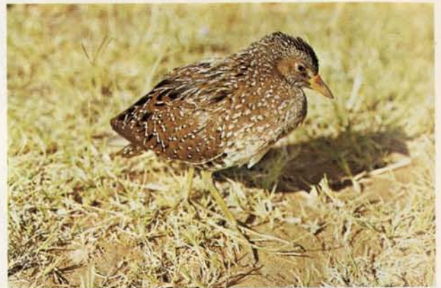
Plate 2: Spotted Crake Porzana porzana ♂.