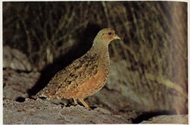
Plate 1: Hartlaub's Francolin Francolinus harlaubi crypticus ♀ at Dolomietpunt, March 1976.

We have recorded this species at Rietfontein, where a number were present in December 1972, obviously on passage.