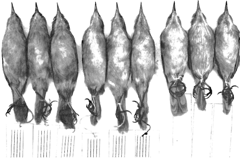
Acrocephalus gracilirostris (Hartlaub)

In size A. g. winterbottomi ranges smaller than A. g. parvus , of which we have three topotypical specimens (wings of 2 ♂♂ 76.5, 71.5, ♀ 71.5, tails 69, 72.5 and 67 mm.) White (1960) has suggested that north-central Tanganyika birds with the dimensions of A. g. winterbottomi (wings of ♂♂♀♀ as given by White 67—70 mm.), and which I believe are the eastern elements of this latter taxon, should be called Calamocichla palustris Reichenow, 1917: Ndjiri Swamp, Masailand, Tanganyika. This name cannot, however, be used in Acrocephalus because of pre-occupation by Sylvia palustris Bechstein, 1803: Germany, so that the applicability of A. g. winterbottomi for such populations is probably unassailable. Strange as it may seem, in suggesting the use of the name palustris Reichenow, 1917, for the dark northern Tanganyika birds like A. g. parvus but smaller, White makes no mention of his own winterbottomi , 1947, which would, by his reasoning, become a synonym were it not saved by the pre-occupation of Reichenow's name when this Swamp Warbler is placed in the genus Acrocephalus , and also by the fact that I am not prepared to follow him in lumping most of the interior equatorial populations of A. gracilirostris in A. g. parvus , and in so doing arriving at a nonsense arrangement.