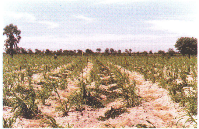
Traditional millet-cowpea intercropping at Onaanda (February 2002).