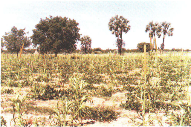
Traditional millet-cowpea intercropping at Omhakoya (February 2002).

Overall intercropping offers for a range of combinations to match individual needs and preferences, local conditions and changing circumstances within each season and from season to season.