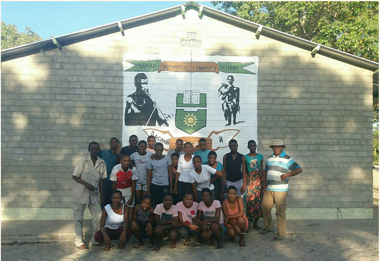
Everybody from the youth to elders is involved, with school visits to national parks and traditional authorities strengthening support for action against wildlife crime

These activities, under the CWCP funding, have unlocked the potential of community members at the grassroots level, especially through community wildlife crime awareness events which have been conducted across all the Zambezi conservancies.